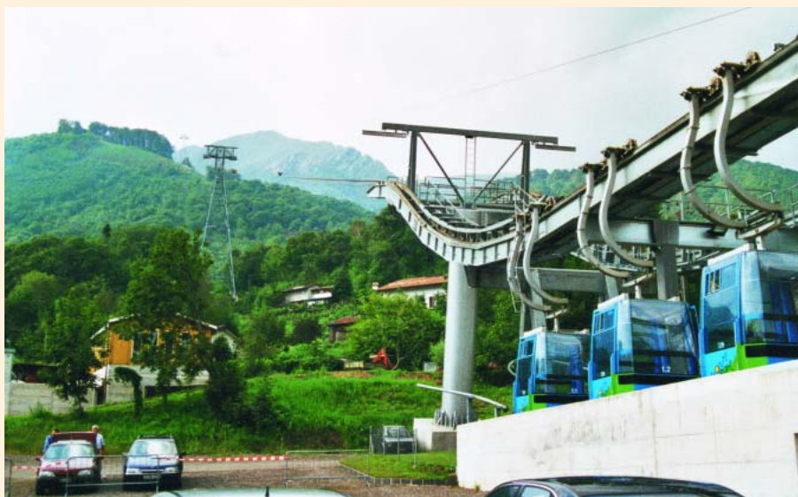
FIGURE 4 The Monte Lema aerial cableway in the Canton of Ticino, Switzerland, in the southern part of the Alps. Tourism is a major source of jobs and has prevented out-migration, especially in poorer alpine regions.

Thanks to great differences in altitude, alpine watercourses have the potential to produce energy. Hydroelectricity is more than an economic factor in alpine countries; it also helps to ensure Europe's supply of energy and cover daily or seasonal demand during peak periods of consumption. Moreover, hydropower is a CO 2 -neutral renewable source of energy.