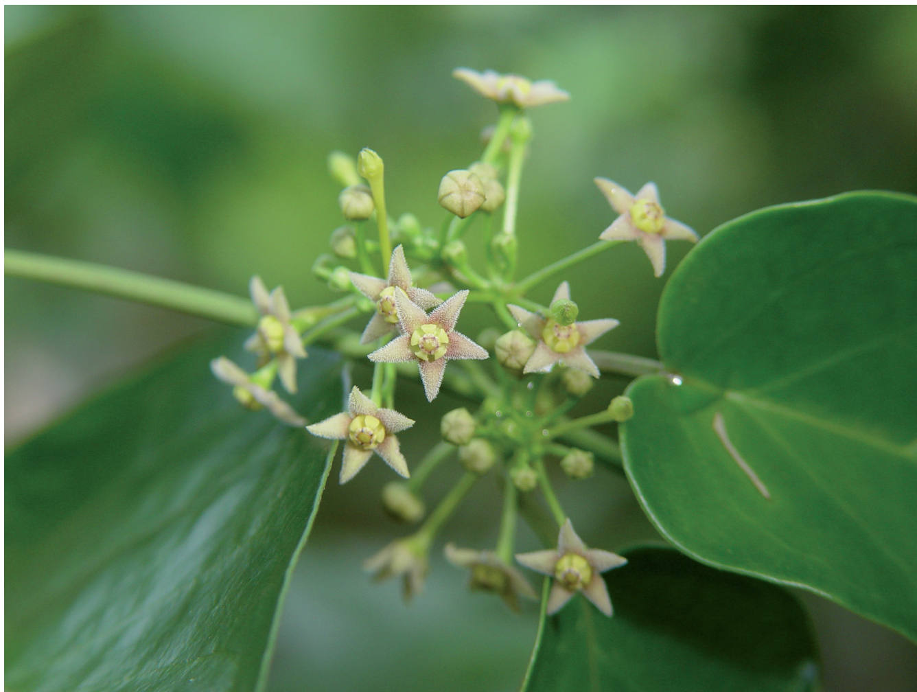
Fig. 3. – Field pictures of the new species Tylophora mayottae W.D. Stevens, Labat & Barthelat.

Conservation status. – Marsdenia mayottae is only known from highly threatened littoral and lowland dry forests on Mayotte, and its population, as currently known, is highly fragmented. It is only known from five locations despite intensive inventories in the last decades. Thus, its preliminary risk of extinction can be assessed as “Endangered” [EN B2ab(iii)] following the IUCN Red List Categories and Criteria (IUCN, 2012).