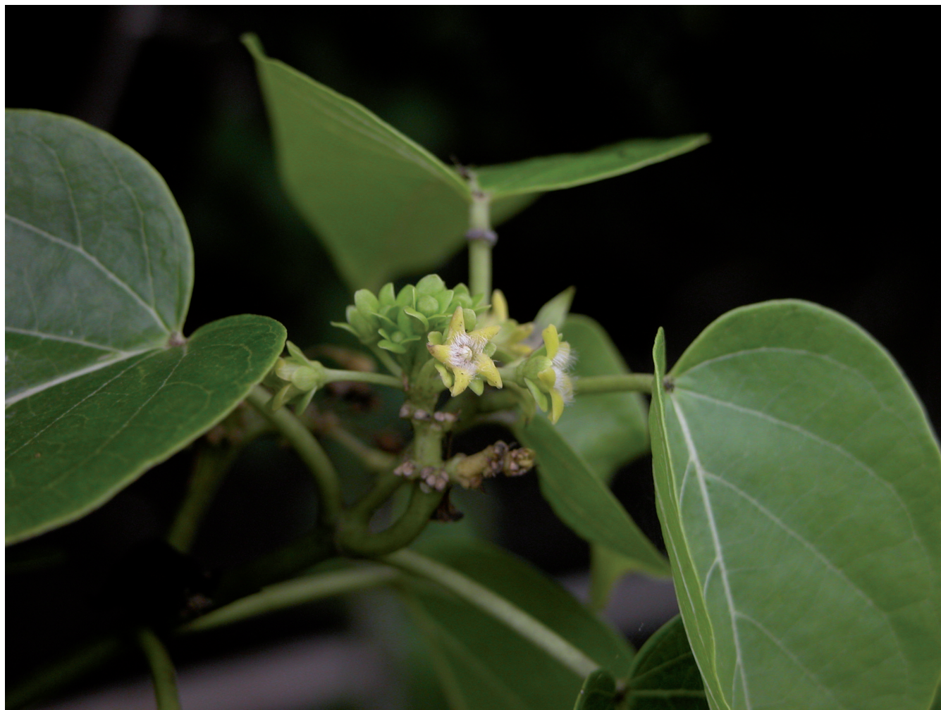
Fig. 2. – Field pictures of the new species Marsdenia mayottae W.D. Stevens, Labat & Barthelat.

style apex umbonate, 1.4-1.5 mm wide at base. Follicles narrowly ovoid with asymmetrical base, 7.5-9.5 × 2.5-3.5 cm, smooth, glabrous, follicle wall 5-7 mm thick; seeds elliptic, 8-11 × 5-7 mm, dark grey-brown with red-brown mottling, margin 0.6-0.7 mm wide, distally entire or inconspicuously crenulate, surface smooth, coma 3.5-4 cm long, white.