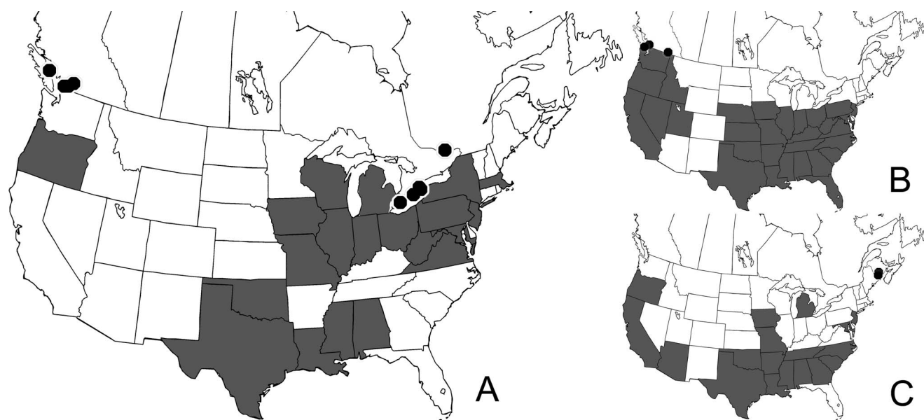
Figure 3. Distribution of Torilis species established in North America by state. (A) T. japonica . (B). T. arvensis . (C) T. nodosa . The distribution in southern Canada is indicated by dots.