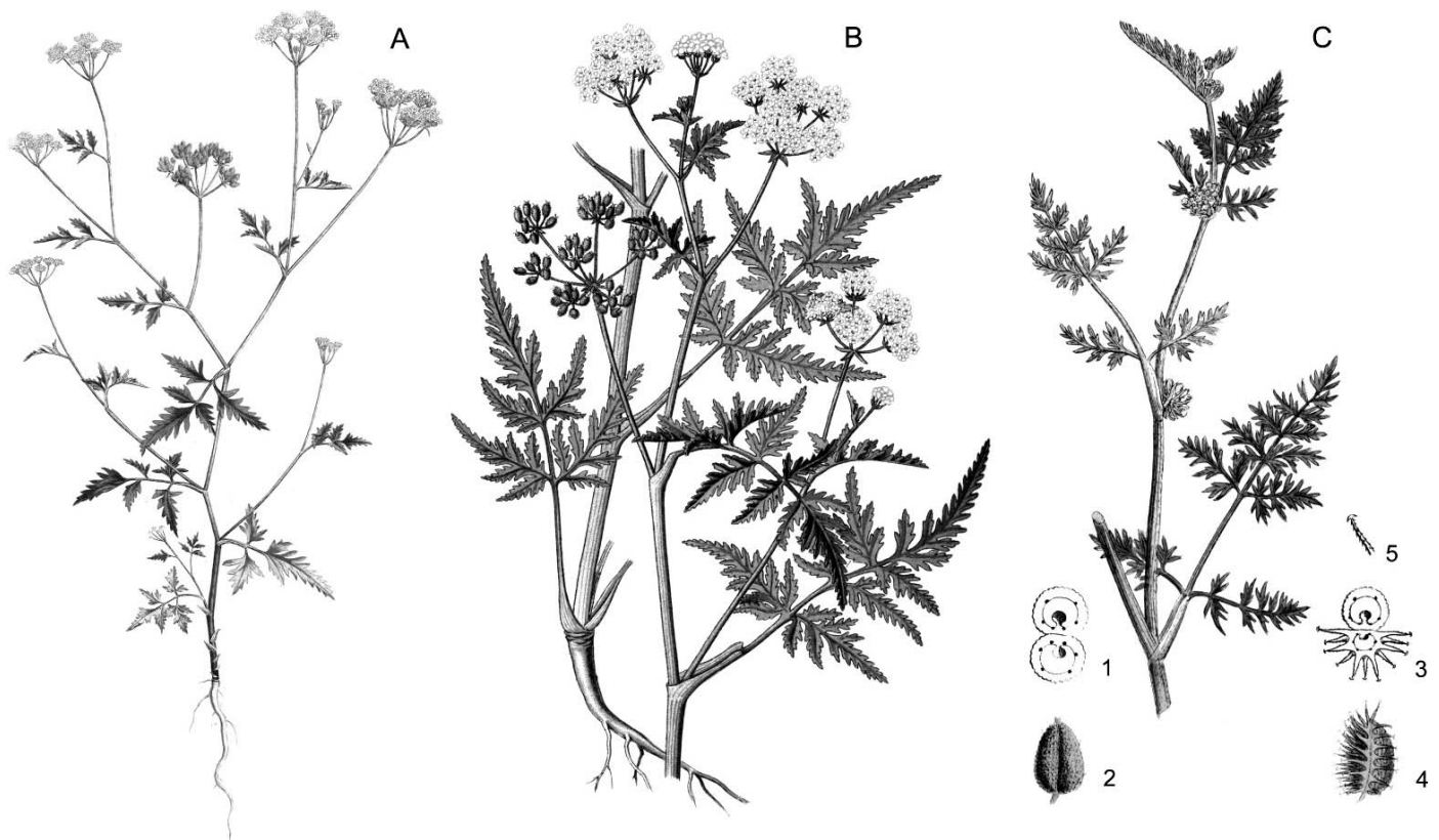
Figure 1. Species of Torilis established in North America. (A) T. arvensis (Curtis 1789 to 1798). (B) T. japonica (Thomé 1921). (C) T. nodosa (Syme 1873): (1) (cross-section) and (2) (lateral view), central schizocarp with both mericarps tuberculate and lacking spines; (3) (cross-section) and (4) (lateral view), outer schizocarp with one spiny mericarp; (5) detail of barbed mericarp spine.

emerging, and the ridged stems have a branching habit. The alternate leaves are deltoid or lance-ovate in outline and two to three times pinnately divided (Gleason and Cronquist 1991), with the leaves toward the base of the plant more heavily divided. Each leaf has three (to five) deltoid and pinnate or lance-shaped and toothed leaflets, with the center (terminal) leaflet being the largest (Czarapata 2005) (Figure 1B). The plant produces both axillary and terminal compound umbels that are loose and open (Figure 1B). The inflorescence is similar in T. arvensis (Figure 1A), but in T. nodosa , the short peduncle (< 1 cm long [0.4 in]), and rays result in a compact, globose inflorescence close to the stem (Figures 1C and 2C). Each umbel of T. japonica is subtended by five to six, more or less, lanceolate bracts, whereas in T. arvensis , there are only zero to one (to three) bracts. Flowers have five pinkish-white petals that are unequal and free, the largest up to 2 mm (0.08 in) long and broad. Flowers are bisexual at the center and staminate at the margin of each umbel. Five stamens alternate with the petals and there are two styles. The ovary is inferior. The stylopodium (enlarged style bases) is broadly conic (Gleason and Cronquist 1991). Fruits are schizocarps (dry indehiscent fruits with two