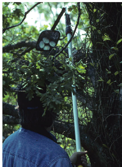
On shore, citizen scientists use mirrors attached to poles to see inside the nests and count the number of eggs and chicks of shorebirds on islands in the Boston Harbor.