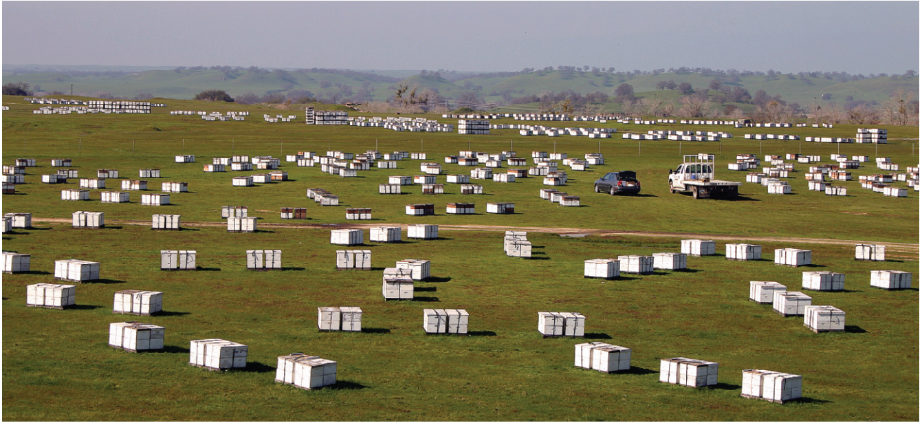
Commercial beekeeping operations may have tens of thousands of hives. Here, hives wait in a “holding yard” for transport to the almond orchards for pollination.