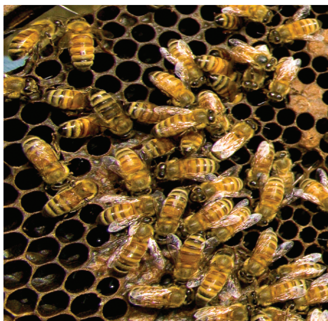
Healthy honey bees on a honeycomb show what a normal colony looks like. With CCD, hives contain few or no adult bees.

The IAPV virus found in beekeeping operations on the eastern US coast and