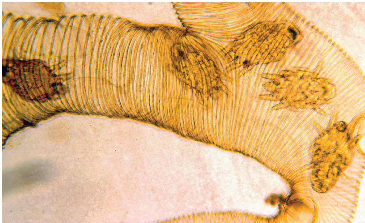
This is a honey bee trachea with tracheal mites, Acarapis woodi . The Honeybee Act of 1922 prevented importation of European bees and kept the United States free of tracheal mites for decades.

of Agriculture's freezers dating from 2002. (Hackenberg remarks that there were similar-appearing die-offs in 2004 and 2005, though on a lesser scale than in 2006.) Cox-Foster explains that Lipkin's group has identified three complete viral genomes: one found in honey bees from Australia, another from Israel, and a third in affected bee operations in the eastern United States and from two sites in Canada (New Brunswick and British Columbia).