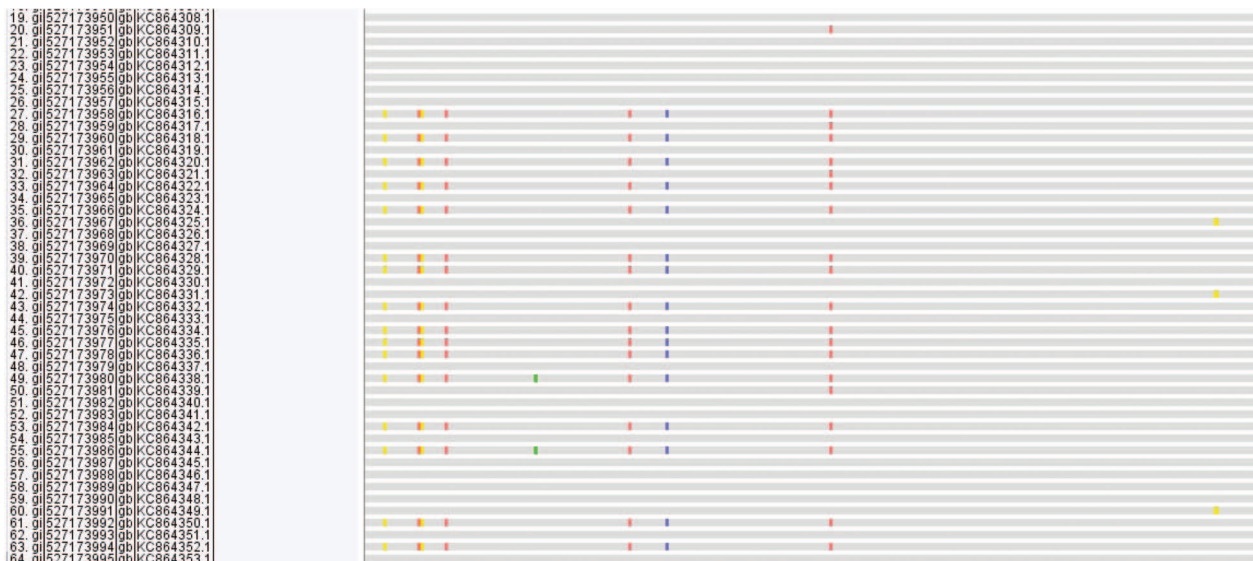
APPENDIX FIGURE 2. Partial screen grab of an alignment of the B-FIB locus from Zink et al. (2013). Variable bases are marked with colored bars. Sequences are in order by population and individual, meaning that the 2 alleles for each individual are adjacent. Paralogous genes are likely because the locus has little overall variability but contains 2 highly divergent gene lineages (differing by 7 substitutions). Additionally, many individuals have 1 allele copy from each of the divergent gene lineages (as seen in the alternating pattern moving down the list of individuals).