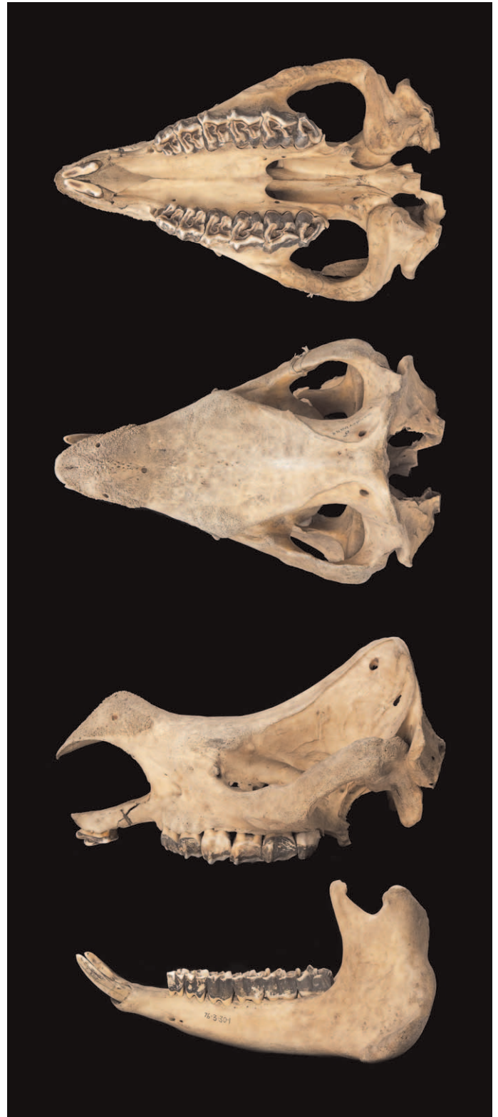
Fig. 4. —Ventral, dorsal, and lateral views of skull and lateral view of mandible of a mature male Rhinoceros sondaicus (Natural History Museum [London] specimen 1876.3.30.1) collected in the Sunderbunds, West Bengal, India, in 1876. Greatest length of skull is 523 mm.