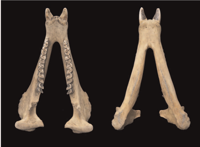
Fig. 5. —Dorsal (left) and ventral (right) views of the mandible of an adult Rhinoceros sondaicus (Natural History Museum [London] specimen 1876.3.30.1); note the large tusklike lateral incisors, characteristic of Asian rhinoceroses, and the 2 alveoli for the missing small central incisors (right mandible), characteristic of the genus Rhinoceros .