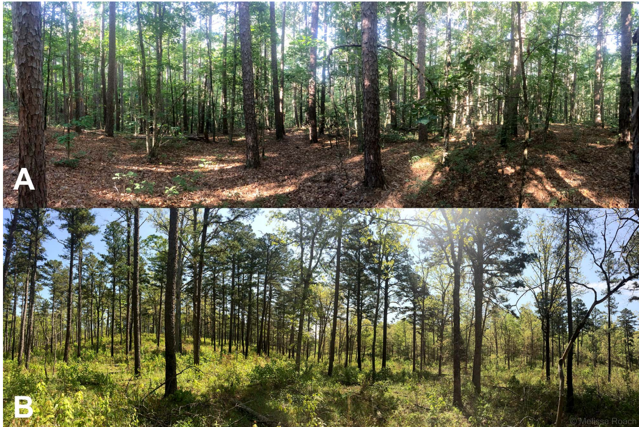
FIGURE 1. Examples of (A) untreated, closed-canopy forest and (B) pine–oak woodland in the process of restoration after tree thinning and prescribed fire in the Ozark Highlands, Missouri, USA.

139,903 ha in the Mark Twain National Forest (MTNF) in Missouri (Mark Twain National Forest 2011). While management is occurring throughout the CFLRP area, treatments are scattered and varied in intensity. We selected 4 70-ha plots within the CFLRP that were accessible by road, known to have moderate detections of our focal species based on point count surveys completed the year prior to our study, and not scheduled for treatment during the study period. Selected plots had received restoration treatment(s), but the extent of management and local site features varied, resulting in a heterogeneous vegetation gradient that spanned a continuum from open savanna–woodland to mature, closed-canopy forest.