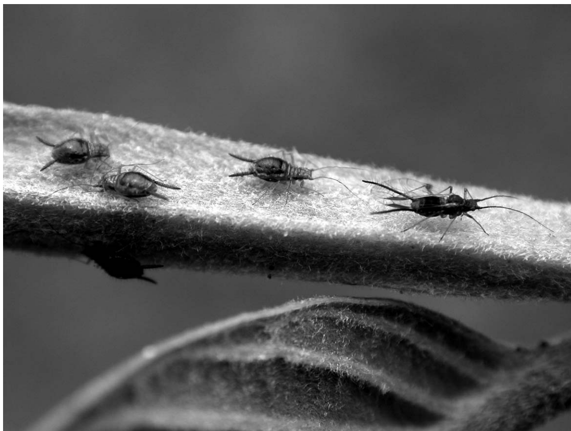
Fig. 1. Viviparous apterae and alatae of Greenidea psidii on Psidium guajava .

The apterae of Greenidea (Trichosiphum) psidii van der Goot 1916 (Fig. 1) are dark brown with long yellowish-brown siphunculi, apically curved outwards. There is a complete description, under the name Greenidea formosana (Maki), in Sugimoto (2008). They live on young shoots and undersides of leaves of species of Myrtaceae (mainly Psidium guajava L., but also on species of Callistemon , Eucalyptus , Eugenia , Malaleuca , Metrosideros , Rhodomyrtus , Syzygium and Tristania ); also, samples identified as this species have been recorded on other plants such as Ficus (Moraceae), Glycosmis (Rutaceae), Scurrula (Loranthaceae), Lagerstroemia (Lythraceae), Nesua (Clusiaceae), Rhamnus (Rhamnaceae) and Engelhardtia (Juglandaceae) (Halbert 2004; Blackman