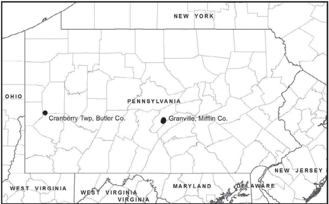
Fig 1. Locations where the emerald ash borer was first discovered and field survey samples were taken in western (Cranberry Township, Butler Co.) and central (Granville, Mifflin Co.), Pennsylvania.