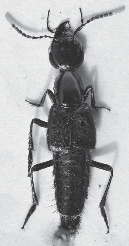
Fig. 1. Holotype of Cafius splendoris

Examination of the holotype of C. splendoris (Figs. 1 and 2) reveals that the specimen represents a species of Hesperus Fauvel. It lacks the diagnostic characters of Cafius but corresponds well to the diagnostic characters for Hesperus : maxillary and labial palps elongate, maxillary palpomere 3 more or less 2.0 times as long as wide, labial palpomere 2 more than 2.0 times longer than wide; largest lateral macrosetal puncture of pronotum separated from lateral margin by more than 3.0 times width of puncture; mesoventrite with rounded intercoxal process; outer edge of front tibia with spines; front tarsomeres 1-4 each with modified pale setae on ventral surface. We herein, transfer C. splendoris to the genus Hesperus .