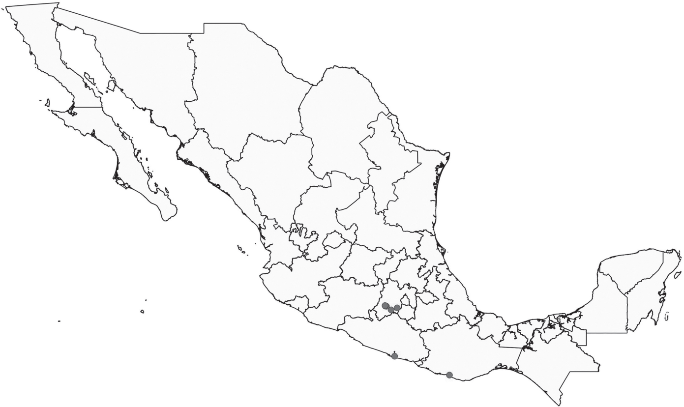
Fig. 1. Regional distribution of Torymus moazopi n. sp. in Mexico.

Torymids were identified following Grissell (1976, 1995). Digital photographs of the diagnostic features present in the new species were taken with a Zeiss® microscope and a digital AxioCam MRc5 camera (Carl Zeiss Microscopy GmbH, Jena, Germany). Table 1 shows the number of examined specimens assigned to the new species together with their localities. Type material is deposited in the Colección Nacional de Insectos, Instituto de Biología, Universidad Nacional Autónoma de México, Ciudad de México, México.