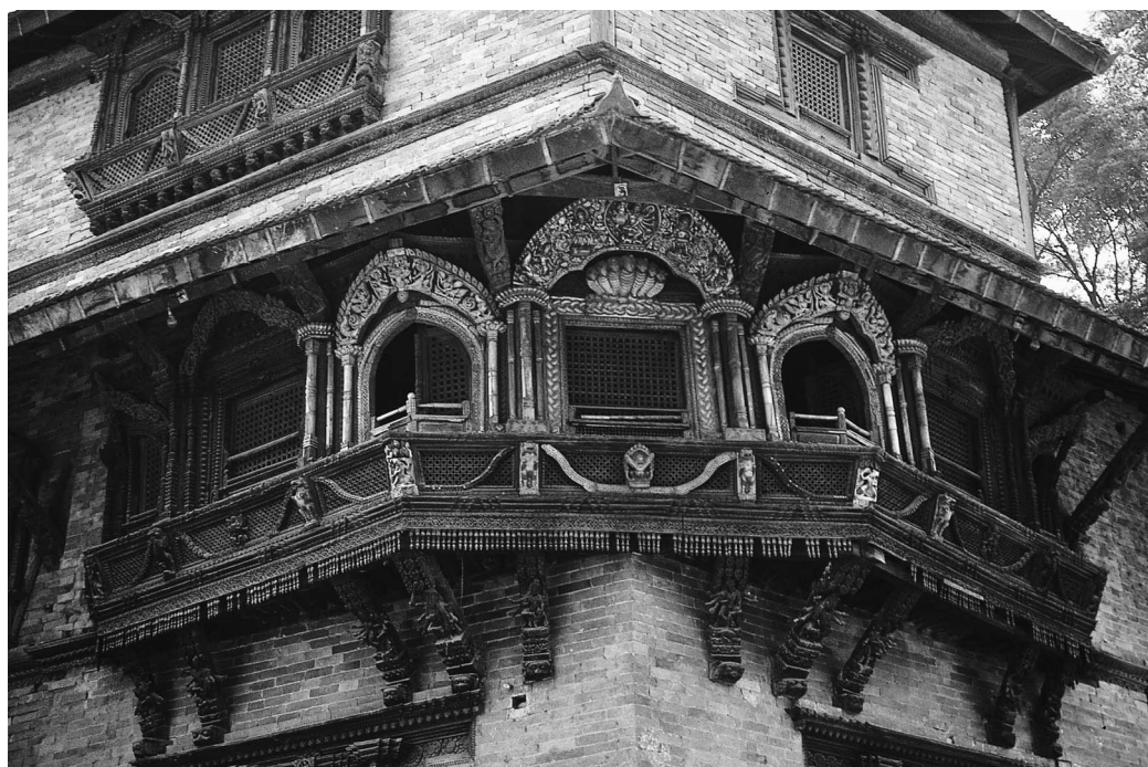
FIGURE 3 Sal (Shorea robusta) is a highly valuable wood used for construction and sometimes for traditional carving; its value is thus also cultural – and, from the more recent perspective of the tourism industry, economic.