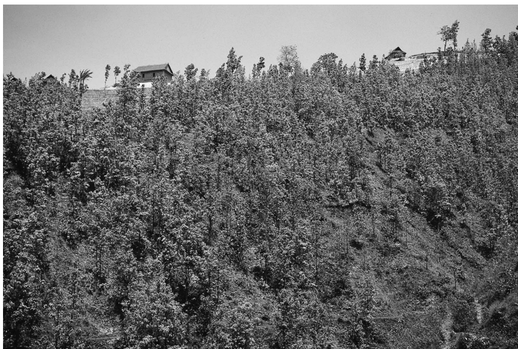
FIGURE 4 A sal forest in the Jhikhu Khola watershed, Sindhu Palchok.

regeneration and mother trees, and 3 = mature forest. The highest score indicates a forest with the highest possibility of obtaining timber and nontimber products (NTFPs) from the forest.