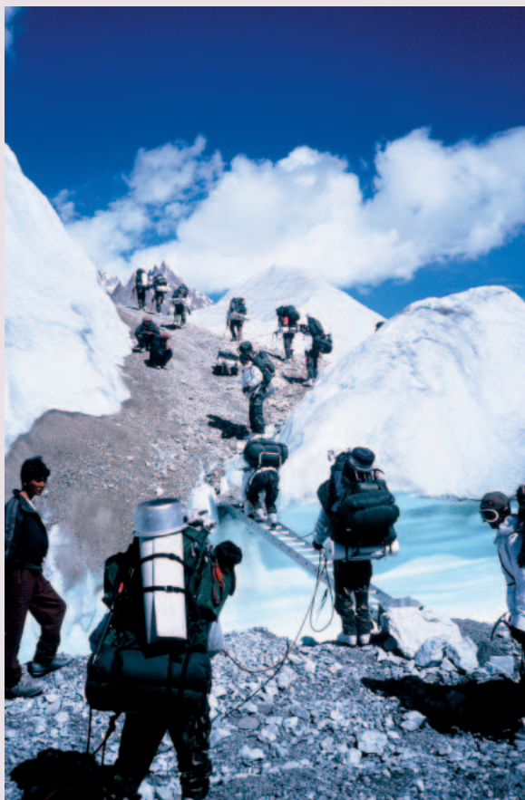
FIGURE 3 Indian army soldiers crossing a bridge on the Siachen Glacier.