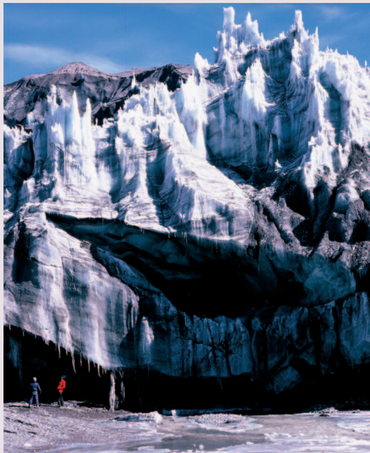
FIGURE 5 A huge ice cave in the Siachen Glacier—a striking visible reminder of the impact of global warming, another major anthropogenic source of risk.

The concept of a Transboundary Peace Park fits in completely with these suggestions, giving a positive dimension to the process. It would work not only toward disengagement but also toward the creation of a park to protect the environment—to allow the ibex, the snow leopard, and the wild roses to return. An informal group of the World Commission on