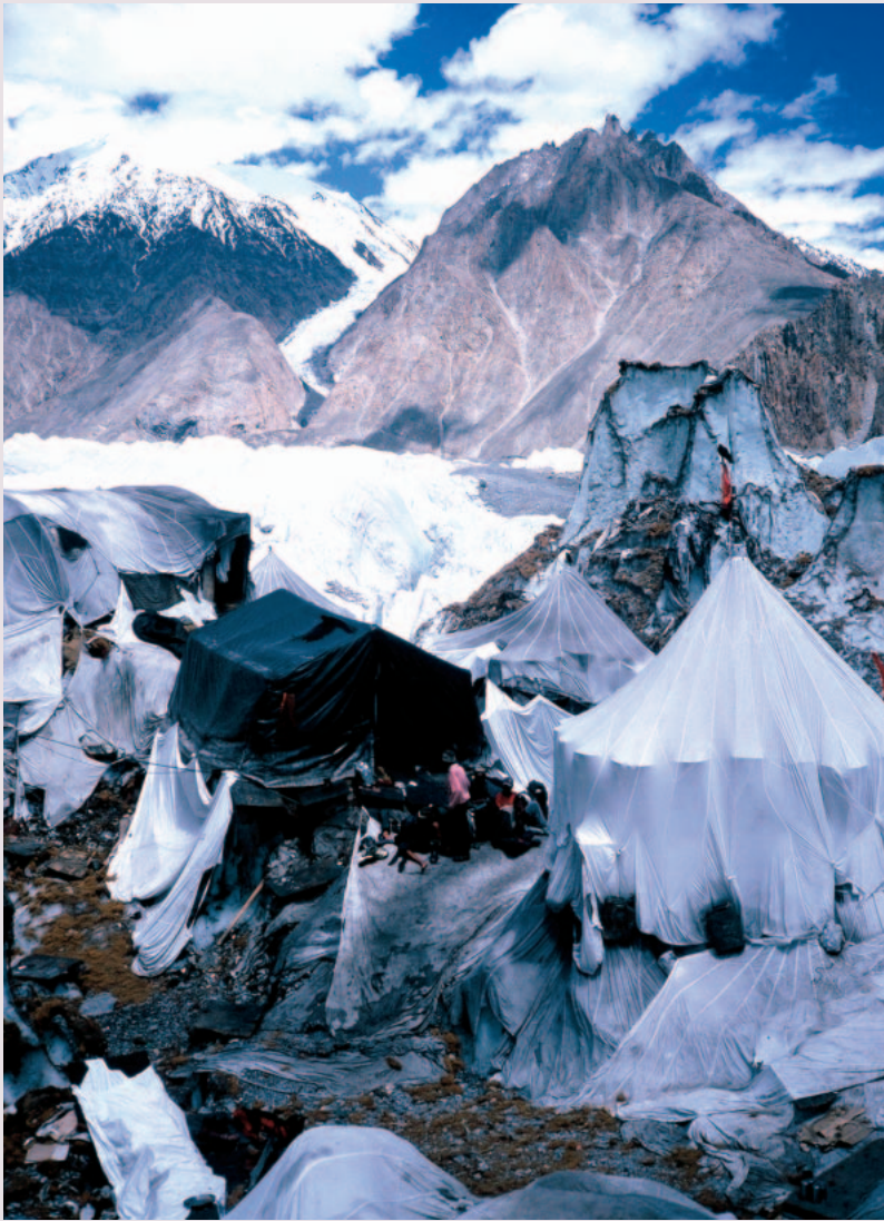
FIGURE 4 An army camp on the Siachen Glacier, showing refuse after days of camping. None of this garbage will be evacuated.

“... surveillance help would also have to include sophisticated airborne radar scanners and night-vision video cameras, such as the Lynx and Skyball systems developed for the Predator unmanned monitoring aircraft that have proved so effective in Afghanistan.” (Selig S. Harrison, in “An American role is crucial,” International Herald Tribune , 12 June 2002)