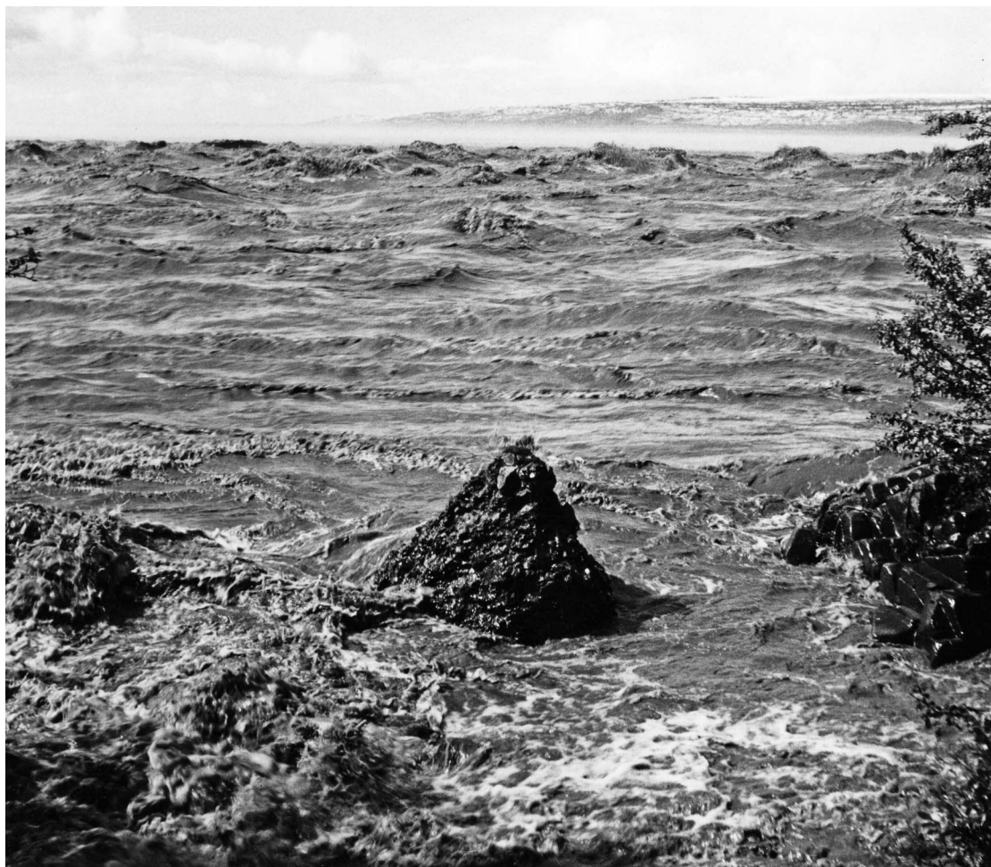
FIGURE 2 Jökulhlaup, southeast Iceland, 18 July 1954. This 'medium-sized' hlaup (outburst flood) has discharged from the southeastern terminus of the glacier Skeiðarárjökull. The floodwaters completely covered the sites of 2 formerly prosperous settlements, Eyrarhorn and Rauðilækur, and several other farms. Destruction of the farmlands and threats to the buildings of Skaftafell forced evacuation up the nearby hillslope in the 1830s.

Syed Hasnain. Note the use of the conditional “could,” in both statements. (These examples and others are discussed at greater length in my recent book, Himalayan Perceptions: Environmental Change and the Well-being of Mountain Peoples .)