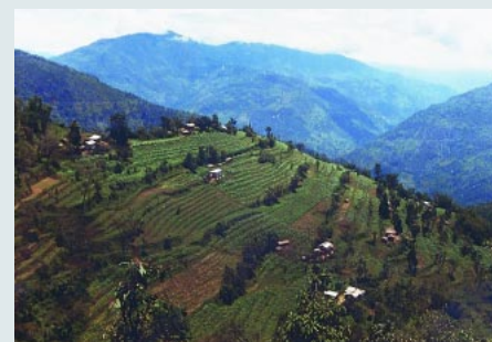
FIGURE 4 Subsistence farming system in the mountains.