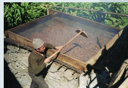
FIGURE 6 Large cardamom curing after harvest in a traditional kiln.

Another cause of decline in large cardamom yield has been infestation mainly by two viral diseases, 'Chirkey' and 'Foorkey.' Uprooting and burning of all the infected plants makes it possible to control these viral diseases. The Dzongu-Golsey variety has been found to be resistant to these viral diseases. Other common diseases are leaf streak caused by Pestatiopsis royenae and anthracnose caused by Glomerella cingulata . These two fungal diseases can be controlled by fungicides. Finally, by planting several wild relatives of large cardamom in each plantation, one can ensure that resistance to diseases will improve and genetic variability will be maintained through crossbreeding.