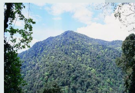
FIGURE 7 Natural forest used for undercanopy large cardamom cultivation.