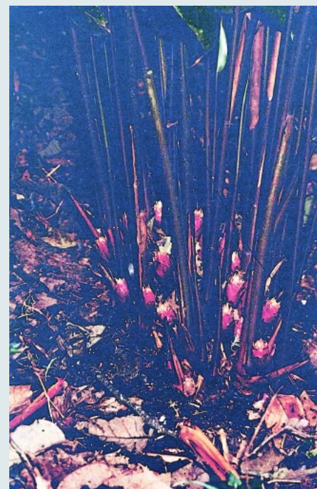
FIGURE 3 Large cardamom bush showing pseudostems and spikes with flowers.

Apart from its high income value and the fact that it is not labor intensive, large cardamom is also a low-volume, nonperishable crop; this is a great advantage in an area