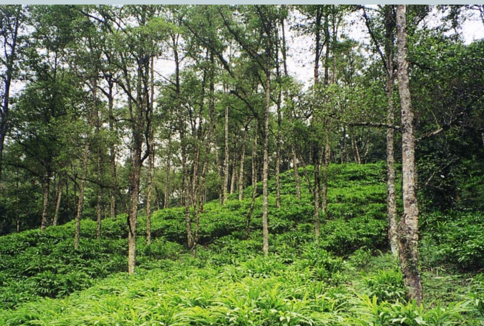
FIGURE 1 Agroforestry system showing large cardamom growing under the cover of N 2 -fixing Alnus nepalensis .

fragmentation of farmland in Sikkim have caused a reduction in per capita holdings. This has forced farmers to cultivate cash crops such as potatoes ( Solanum tuberosum ), ginger ( Zingiber officinale ), and mandarin oranges ( Citrus reticulata ). The latter two have caused rapid nutrient depletion of the soil. Production of another cash crop, large cardamom ( Amomum subulatum ), a plant native to the Sikkim Himalaya, has been a boon to the mountain people of the area. Large cardamom is a perennial cash crop grown beneath the forest cover on marginal lands. Its cultivation is an example of how a local mountain niche can be exploited sustainably.