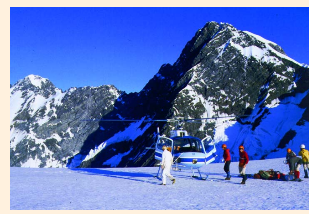
FIGURE 3 A helicopter unloads climbers on Faith Col. Mt Hopkins behind.

Much filming of the movie Vertical Limit occurred in the park, with extensive use of helicopters, including in the Hooker Valley.