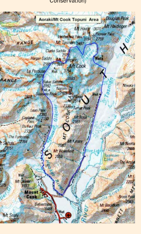
FIGURE 4 Map of Aoraki/Mount Cook topuni area.