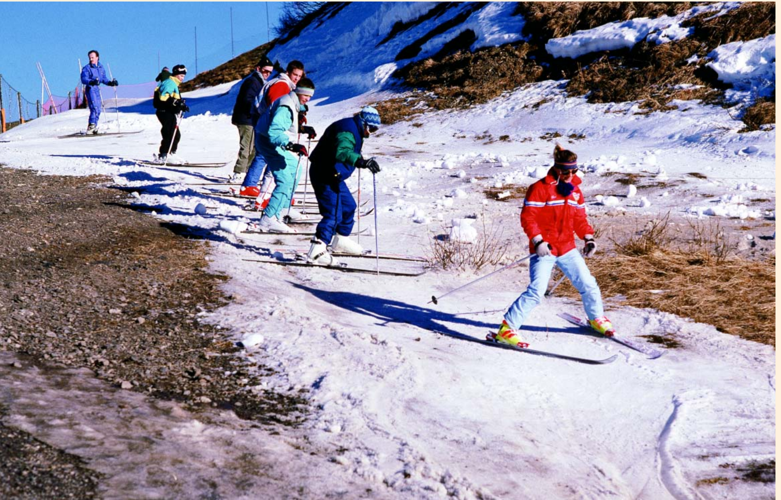
FIGURE 2 Artificial snow was needed to keep this ski field in Termignon (French Alps) functional.

Reliable snow cover—A (Swiss) ski area has reliable snow cover if there is a minimum cover of 30–50 cm (12–20 inches) on at least 100 days in 7 out of 10 winters, from 1 December until 15 April.