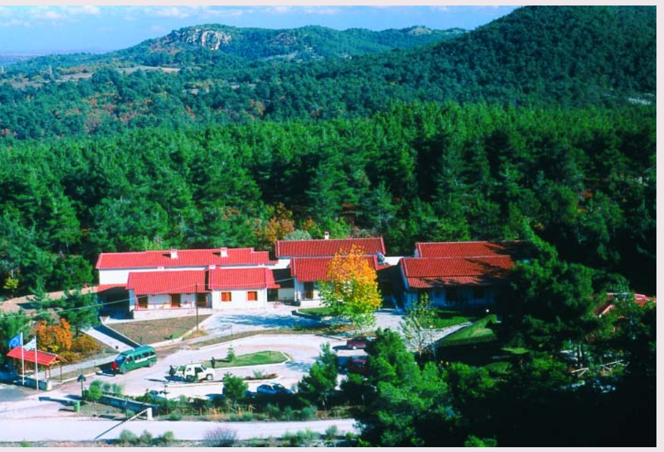
FIGURE 3 The Dadia Ecotourist Center includes 20 guest rooms, a coffee shop and restaurant, an information center with a permanent exhibition of flora and fauna, and a small shop with local products and information related to nature conservation.

economy that coexisted with wildlife was the decline in grazing. Nomadic tribes were forced to settle after 1950 and could no longer support the large herds that had traveled up and down the mountain slopes of the Balkans for centuries. As a result, flocks decreased, and so did the opportunity to feed on stray, sick and old animals, depriving birds of prey of a vital food supply. The use of agrochemicals also helped to hasten the decline of the agrarian economy.