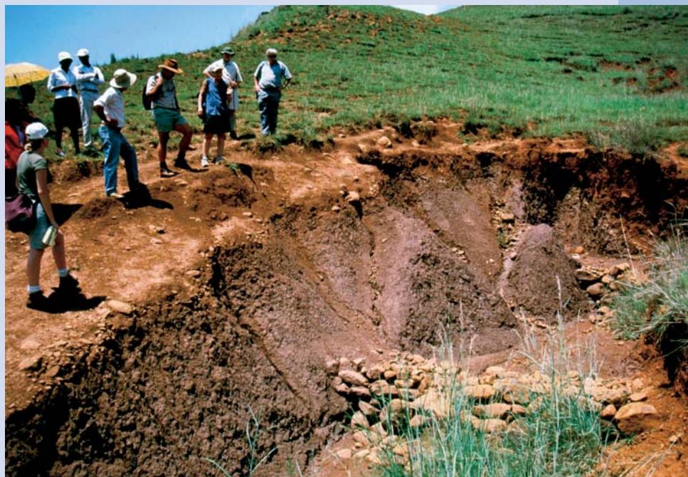
FIGURE 4 Gully erosion near Mweni, in the Kwa-Zulu/Natal part of the study area. The local community has undertaken reclamation work to halt erosion.

nize and integrate traditional knowledge and community needs and expectations into planning and strategy.