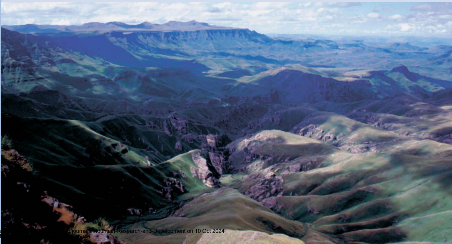
FIGURE 1 The grandeur of the Maloti–Drakensberg Mountains: panoramic view of the Drakensberg Mountains looking north from the peak known as the Rhino to the famous Sani Pass.

The region’s function as a water catchment is important because it is one of only a few in southern Africa where long-term annual precipitation exceeds