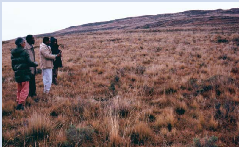
FIGURE 5 Improved rangelands in Lesotho after successful implementation of range management strategies.

help in the development of specific strategies for grassland conservation (see Box).