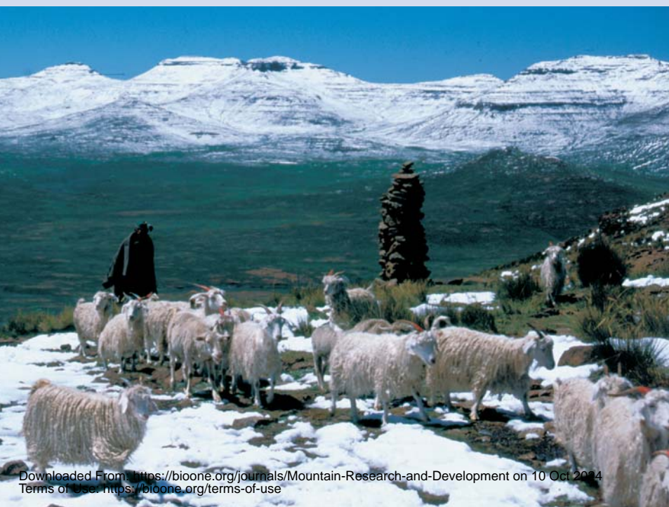
FIGURE 3 Herders and their goats, facing extreme conditions in the Lesotho part of the study area.

The last finding is of significance for any socioeconomic development intervention in the area, in that effort is clearly required to increase occupancy rates. Additional tourism-related development may contribute through the initial supply of employment opportunities in the construction phase, but once development is complete, added competition could lead to further weakening of the industry. The significance of this statement in an article