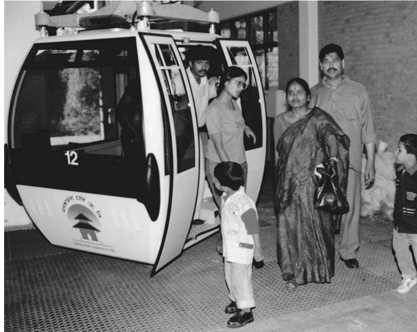
FIGURE 2 Indian pilgrims arriving by means of the new cable car. Thousands of pilgrims choose to travel this way every day instead of walking, as prescribed by their religion. Using conventional categories (“foreign or domestic tourism,” “tourism versus pilgrimage,” etc) to describe tourist activities makes it difficult to account for these changed practices.

pilgrims’ use of modern means of transportation that spearheads this cultural change (Figure 2). The changing religious and social practices of pilgrimage at the Mountain Temple of Manakamana illustrate this contention. Practically, all domestic and foreign visitors to the Manakamana Temple appear to represent the classical pilgrim in so far as they conduct their ritual affairs in a proper manner at the Goddess’s shrine. A picture of stable practices and underlying notions is radically questioned when focus is shifted from the rituals in the crowded temple courtyard and the inner shrine to the conscious motivations and the whole process of the pilgrimage, as illustrated below by our qualitative study.