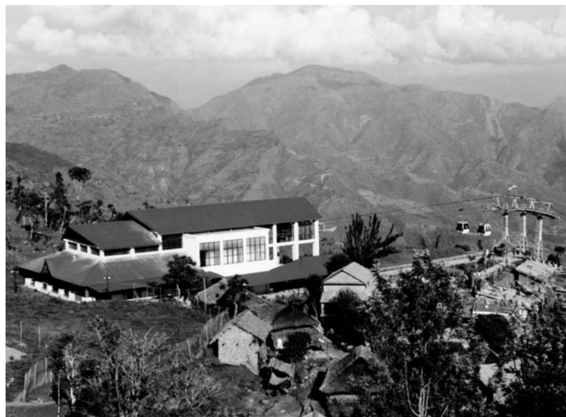
FIGURE 4 View of the upper station of the new transport system, the first of its kind in Nepal. Planning of such major tourism developments requires careful consideration of ecological, social, and cultural factors.

It remains true that the growing numbers of pilgrim tourists and the prospects for further increases attributable to pilgrim tourism's broad domestic and regional appeal point to considerable income and development potential for both national economies and local communities (Figure 4). The effects on international travel of the current unstable global and subregional security situation should alert researchers and policy makers to