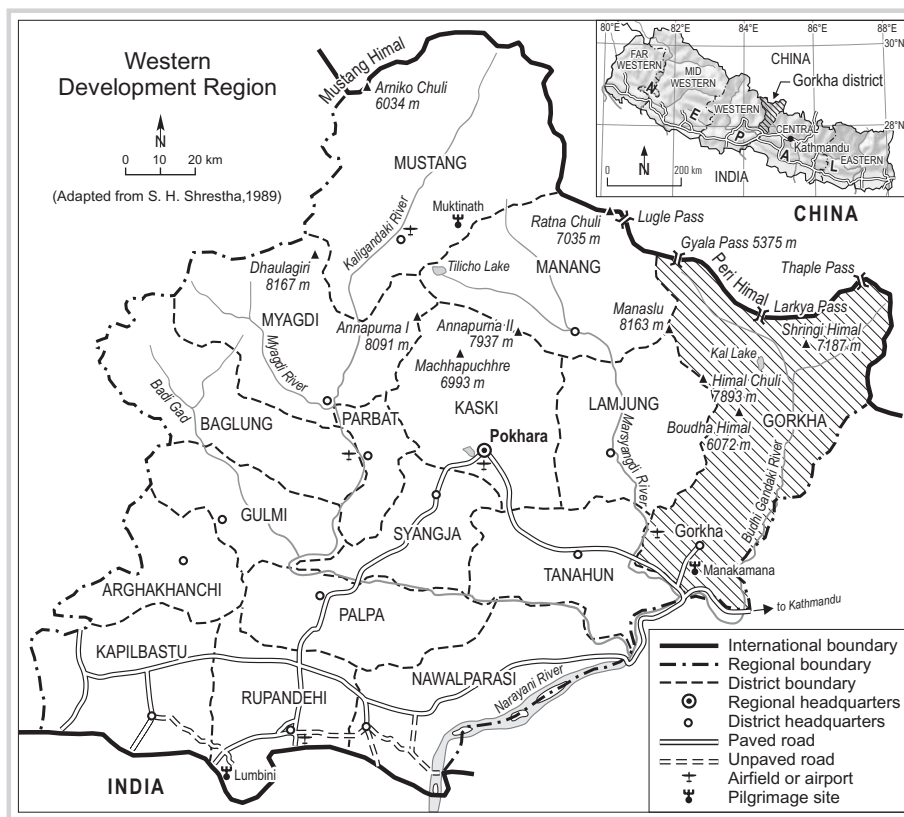
FIGURE 1 Location of Gorkha District and Manakamana. (Map by Andreas Brodbeck based on Shrestha 1989)