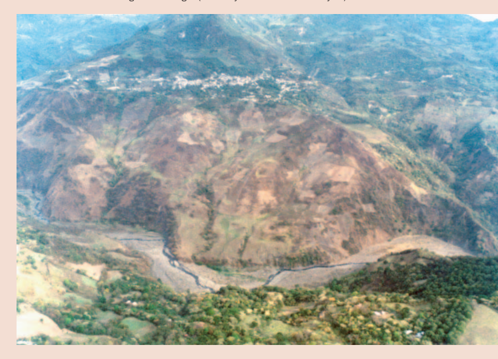
FIGURE 2 Several communities are located on slopes where landslides occurred long ago, and the risk of new landslides occurring remains high.