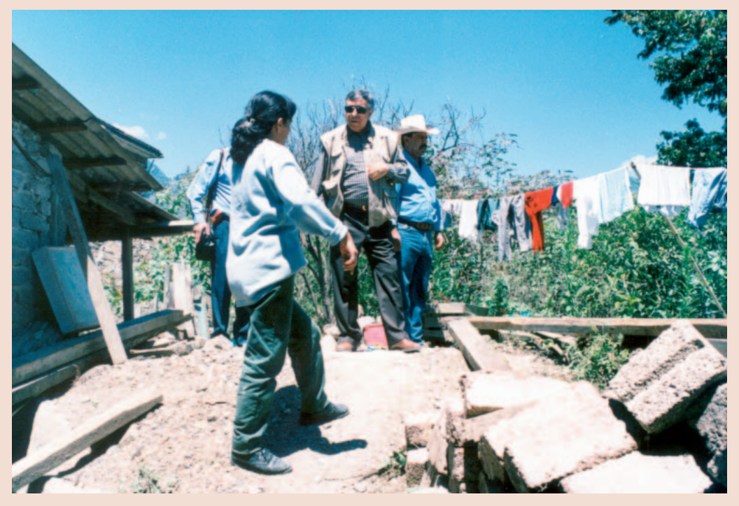
FIGURE 3 Involvement of local actors is a key to development of adequate strategies for disaster prevention. The high level of vulnerability of the local population is also reflected in poor housing conditions.

disaster processes in mountain areas in least favored countries is undoubtedly urgent. On the one hand, there is a lack of scientific research regarding instrumentation, monitoring and modeling in these areas, and a need to better understand the processes themselves, including the potential impact of extreme rainfall events and the role deforestation plays in soil hydrology. On the other hand, considerable further attention is needed to assess the vulnerability levels within communities. When conducting vulnerability research, it is crucial to consider factors such as social, economic, political and cultural issues, which ultimately determine the predisposition of the endangered communities to confront disasters.