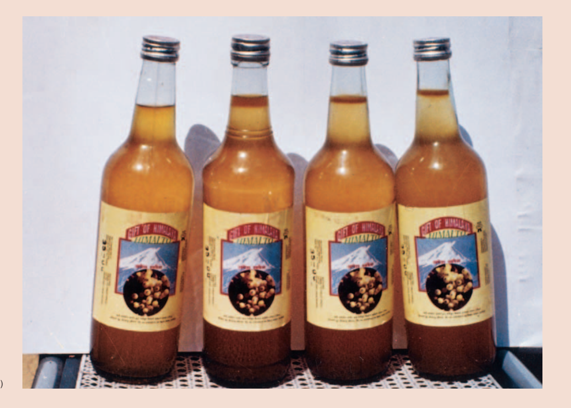
FIGURE 2 Juice prepared from wild Hippophae rhamnoides berries.

The Central Himalaya, particularly Uttaranchal, is an important religious and tourist center, visited by millions of pilgrims and tourists every year. If the quality