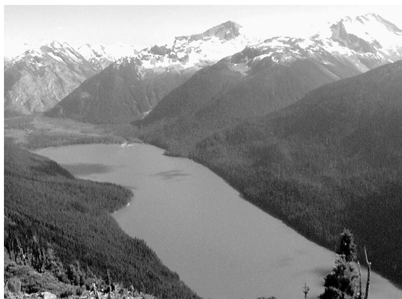
FIGURE 3 Many visitors are motivated to hike along the Musical Bumps Trail to experience the alpine area and scenery, which includes this view from Flute Summit (Site 3) of the surrounding glaciers and Cheakamus Lake.

ioral approach to commercial recreation and tourism settings. This paper has helped to address both of these knowledge gaps. The findings presented here, however, are limited to a single alpine ski area and may not generalize to all ski areas where chairlifts operate in the summer. The applicability of these findings to other ski areas and commercial recreation and tourism settings remains a topic for further empirical investigation.