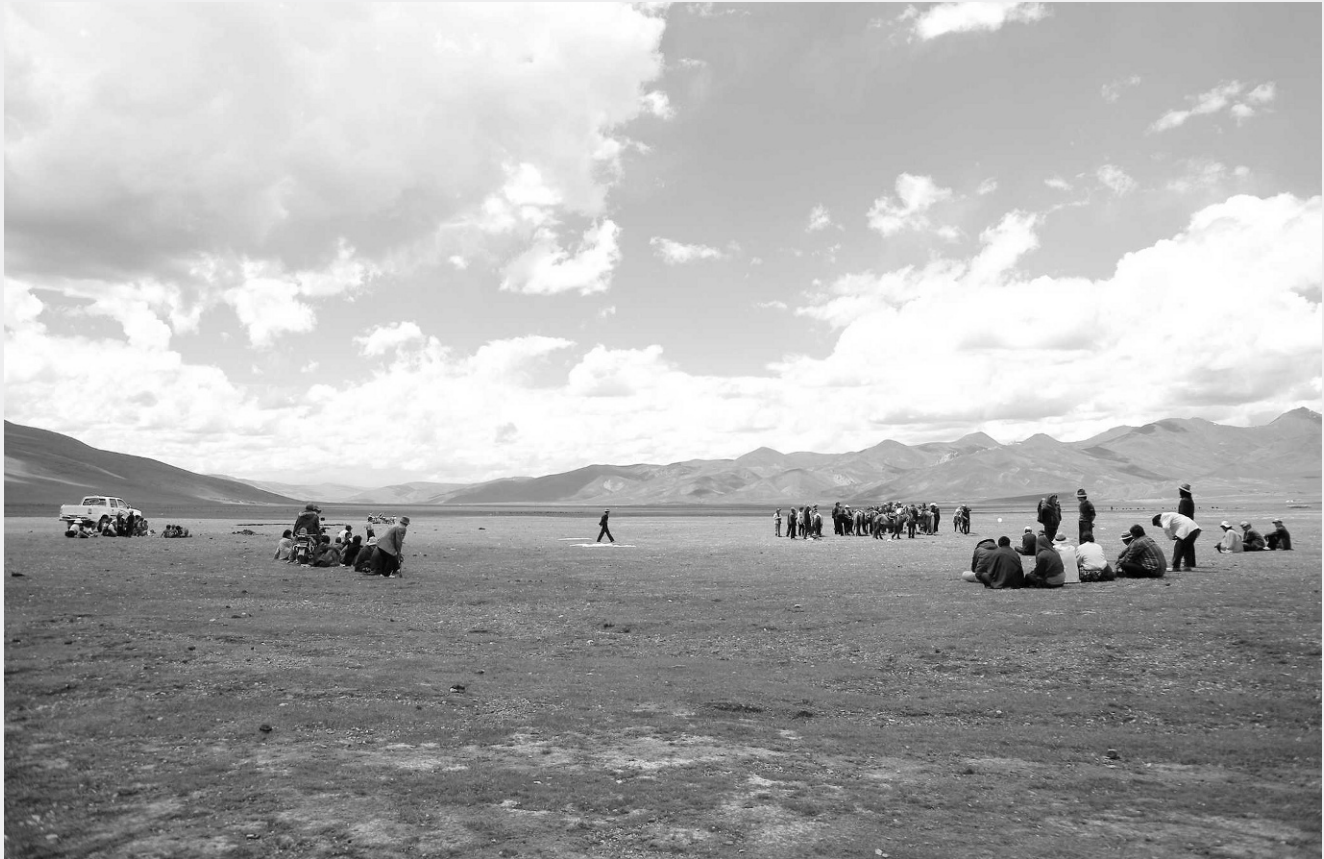
FIGURE 2 Community horse race for team building in Longbaotan, China. Such major community activities are an important means of building local support and doing teamwork with the indigenous communities, for conservation efforts initiated by WWF.

people's livelihoods in this region, as well as the millions of people who depend on freshwater downstream, WWF's Regional Initiative, Saving Wetlands Sky High, is working in 5