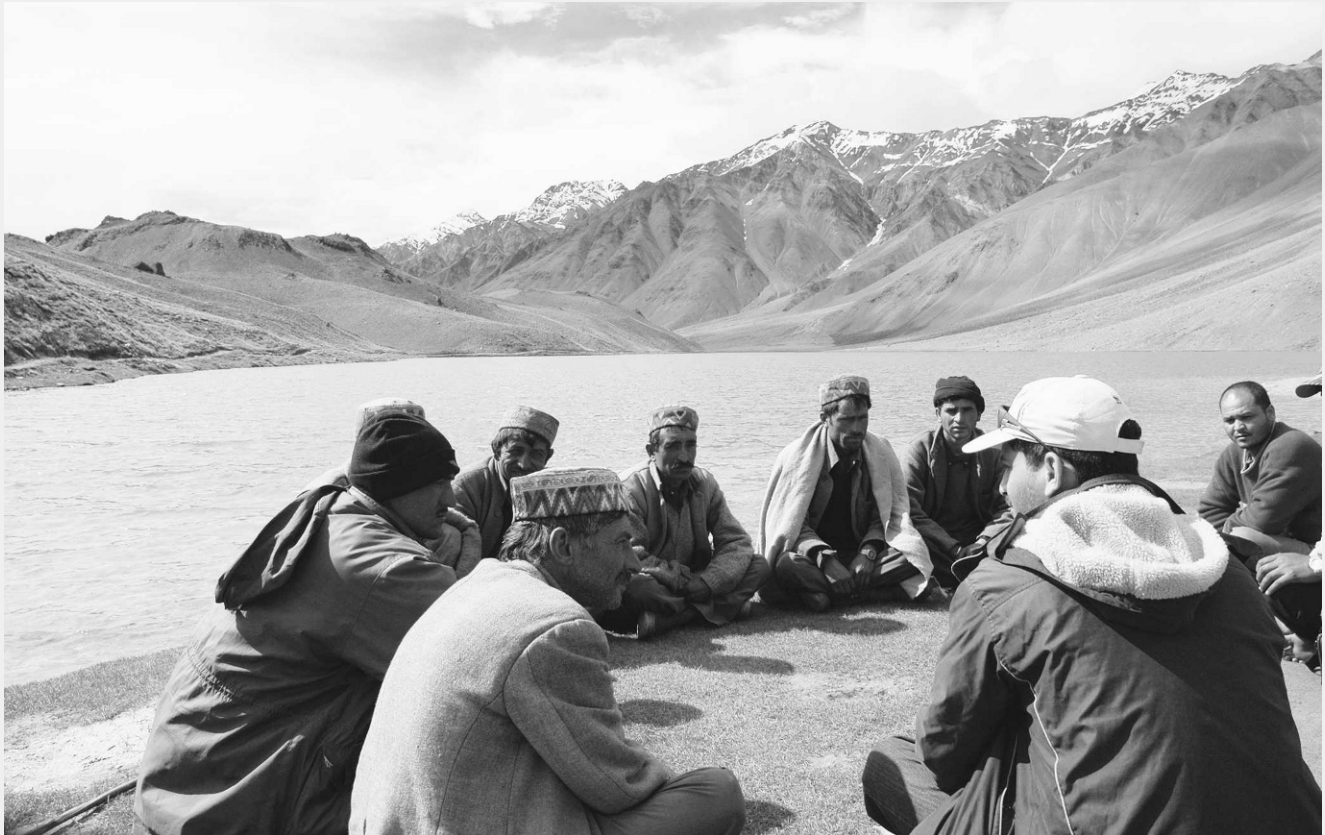
FIGURE 5 A group of local people discussing conservation issues on the banks of Chandrataal Lake, Himachal Pradesh, India.

Lakes, permafrost and wetlands play a great role in regulating lateral flow of rivers. The increased air temperature results in earlier melting of the frozen soil and increased soil evaporation. This results in a decline in the groundwater table and water levels of the lakes, which reduces water supply of baseflows from groundwater and lake water. The water resources in the region declined between 1956 and 2004 due to the above changes. In addition, in some parts of the Yellow River, sources were converted from grassland to cropland, which adds to the problem.