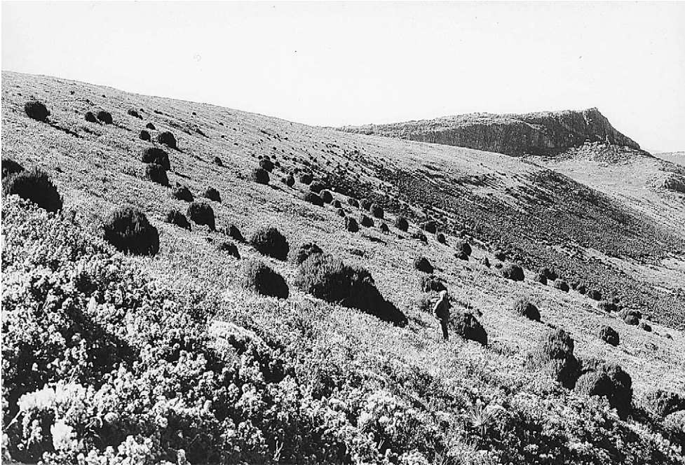
FIGURE 3 Probably undisturbed treeline ecotone in southern Ethiopia: Erica thicket disintegrates into isolated spherical individuals. The soil is completely shaded with a thicket of 30 to 50 low scrambling Alchemilla haumannii . Bale Mountains, Wasama, 6°55' N / 39°46' E, 4080 m. (Photo by Georg Miehle, 11 January 1990)

(21 August, 16–19 September 2004) suggest that this valley is a wind channel for strong and dry southerly winds. Since the radiative forcing at the site is certainly very different from that recorded at the nearest climate stations, it is doubtful whether any conclusions about the climatic conditions at the local treeline can be drawn, as the climatic causes of treelines are still under-investigated (Körner and Paulsen 2004).