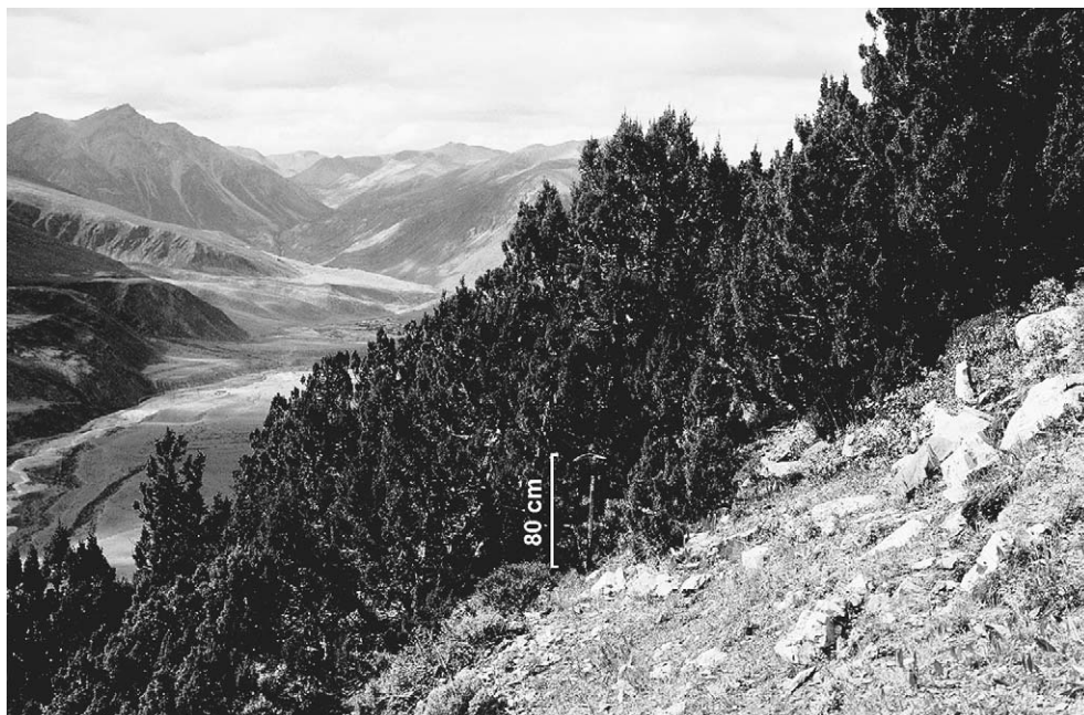
FIGURE 2 Highest forest stand of Juniperus tibetica in southeastern Tibet, located at 4900 m (29°42' N / 96°45' E Gr). (Photo by Georg Miehe, 17 September 2004)

Asia (Miehe and Miehe 2000) confirm widely accepted evidence that the upper limit of the forest belt is not a line but an ecotone (Körner 1999). The 'highest tree-line' therefore designates an imaginary line connecting scapose phanerophytes. In most humid mountain ranges, single or multi-stemmed woody perennials become increasingly less abundant, forming a pattern that shifts from a closed crown-interlocking forest to isolated individuals. Simultaneously, their heights gradually decrease until they barely emerge from a closed layer of shrubs (Miehe and Miehe 2000).