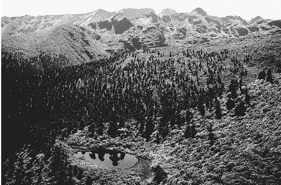
FIGURE 4 Black Mountains, Central Bhutan, 27°23' N / 0°42' E, 4250 m: probably undisturbed treeline ecotone of the southeastern Himalaya: in the treeline ecotone with a closed evergreen broadleaved rhododendron thicket, closed Abies densa forests disintegrate into isolated trees. (Photo by Georg Miehe, 16 October 1998)

highest vegetation layer disintegrates over a vertical distance of only 50 to 100 m into isolated Erica shrubs or Abies densa trees, emerging from a closed carpet of 30–50-cm tall Alchemilla haumannii in Africa, or a closed thicket of 1- to 2-m tall evergreen rhododendrons in the Himalayas.