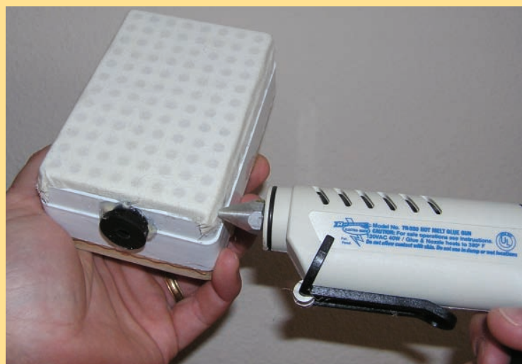
Figure 5. White felt or similarly porous fabric is placed over the top of the pipet tip box and secured around the edges with hot glue.

Drosophila in culture tubes or stock vials must be anesthetized before they are transferred to the staging apparatus. First remove the tubing from the rubber stopper on one of the stages. Carefully invert the culture tube or stock vial so anesthetized flies don't fall into the culture medium, insert the rubber tube