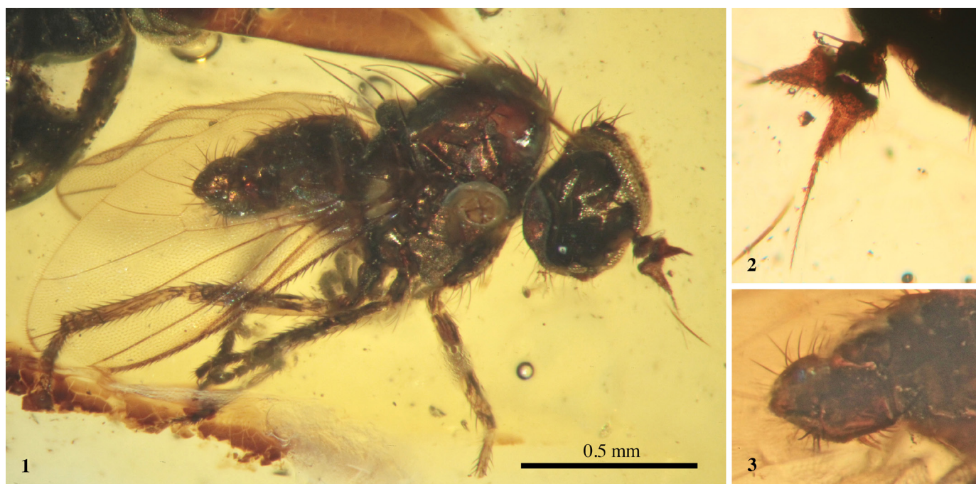
Figure G1. Microphorites magaliae n. sp., holotype male IGR.GAR-106a, in Late Cretaceous amber of Vendée, NW France. 1, habitus in right lateral view; 2, detail of antennae; 3, detail of the genitalia.

terminalia rotated forward beneath the preceding segments of the abdomen (Wiegmann, Mitter, & Thompson, 1993). Microphorinae and Parathalassiinae are distinguished from other dolichopodids by the presence of an additional basal crossvein (bm-cu) and crossvein dm-cu connected to the base of M_2 . Recent molecular analyses even suggest that Parathalassiinae are part of Dolichopodidae s.str. , with Microphorinae as sister group to the latter (Germann & others, 2011).