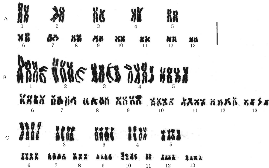
Fig. 3. Karyotypes of a control diploid (A), an autotetraploid (B), and an aneuploid (C) of the second-generation offspring observed by the tail-tip squash method. Karyotype of the autotetraploid (B) possessed four genome sets consisting of five large (Nos. 1–5) and eight small chromosomes (Nos. 6–13). One of chromosome No. 8 and two of chromosome No. 11 were lost in the karyotype of the hypotetraploid (4n-3) (C). Scale bar represents 10 \mu m.