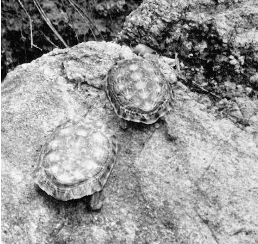
Figure 5. A pair of pancake tortoises at Kawelu (Mwingi district).