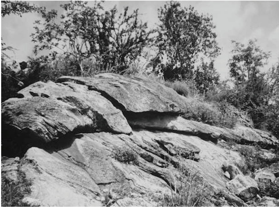
Figure 3. Typical Pancake tortoise habitat in Acacia-Commiphora bushland. Exfoliating rock slabs at Kalanga, Mwingi district.

vegetated rock outcrops. Such well sheltered rock crevices probably provide thermal buffering against overheating and desiccation during the dry season.