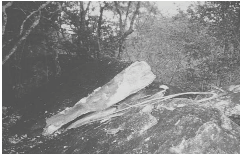
Figure 6. Physical evidence of site exploitation in Kawelu area (Mwingi district). Note the broken down rock slab and the improvised hooked extraction sticks lying on top.

Spellerberg (1992) suggests that the illegal trade in wildlife and their products threatens many species with extinction. Over-collection of tortoises for the international pet trade threatens the survival of the pancake tortoise population in Kenya. There are reports of illegal tortoise collection in many parts of Mwingi district and there was physical evidence of collection at Kawelu where a rock slab had been broken using another rock allowing freer access to the crevice inhabitants (figure 6). Tortoise collectors have visited most of the areas surveyed in Mwingi district and have had depleting effects in areas like Nguni. Incidentally, Mwingi district is the only area within the Kenyan range where local people are familiar with the species. In Isiolo, Marasbit and Samburu districts for instance most people are not familiar with the species and consequently there were no reports of tortoise trade. Collection of tortoises has a detrimental demographic effect on the population, a scenario described by Boycott & Bourquin (1988) and Klemens & Moll (1995).