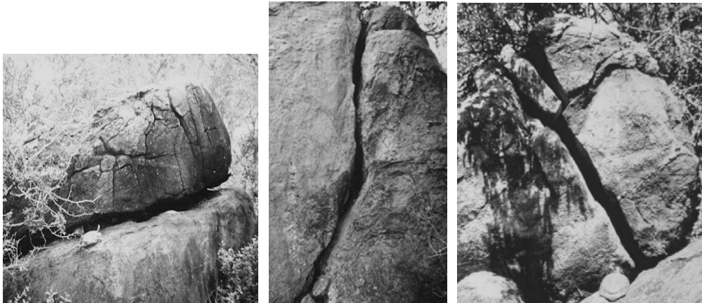
Figure 4. Three representative crevice configurations inhabited by pancake tortoise.

Optimal Pancake tortoise habitat is usually provided by rock outcrops and kopjes that have been exposed for a long time to weathering and erosion so as to produce suitable crevices. These micro-habitats represent only a small proportion of all crevices in any given