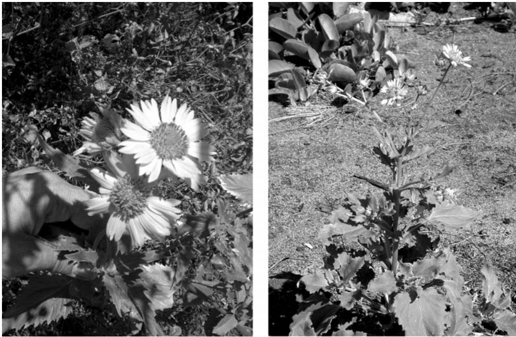
FIGURE 1. Verbesina encelioides (golden crownbeard) growing at Kanahā Beach Park near Kahului, Maui, Hawai'i.

Common names: golden crownbeard, crownbeard, golden crown daisy, wild sunflower, cowpen daisy, girasolcito, anil del muerto, yellowtop, American dogweed, butter daisy, South African daisy.