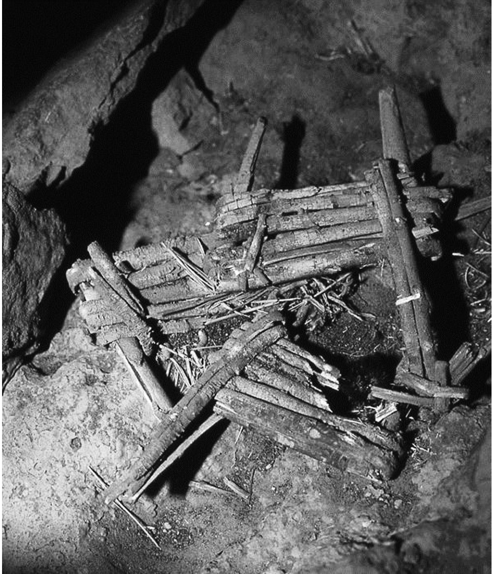
Figure 4. A cache of three split-twig figurines placed in a circular pattern as found under a cairn at Rebound Cave, Grand Canyon. This cairn is Cairn 9 as described by Emslie et al. (1995).

All 15 dates from Grand Canyon indicate a narrow temporal range of 4390–3100 BP for this complex (Table 1 and Fig. 3). Although this range extends over 1000 years, if the oldest and youngest dates are removed from consideration, the remaining dates form a tighter cluster ranging from 4095–3530 BP, or a period of only about 500 years. These remaining dates also form several distinct clusters in age. For example, the older dates from Stantons, Rebound, and Right Eye caves are essentially contemporaneous in the 4000s BP, with that from Horn Creek nearly so. The date from Five Windows Cave 3 is identical to one other date from Rebound Cave at 3850 BP. In addition, other dates from Rebound Cave in the 3700s BP, with