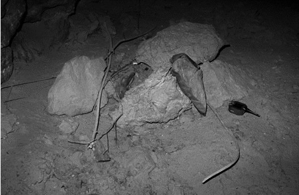
Figure 2. One of eleven cairns found in Crescendo Cave, Grand Canyon, with several long, unmodified and split sticks in association. This cairn is Cairn 5 as described by Emslie et al. (1995).

fawn survival. The higher mortality was caused by a combination of lack of water and absence of nutritious forage. Desert mule deer ( Odocoileus hemionus Rafinesque) are similarly affected. Smith and LeCount (1979) completed a nine-year study of this species in Arizona and found a strong correlation between winter precipitation, forb and small shrub productivity, and fawn survival. Lawrence et al. (2004) studied deer survival for nearly three years in southwest Texas. They also found a direct correlation between periods of drought with adult female and fawn survival.