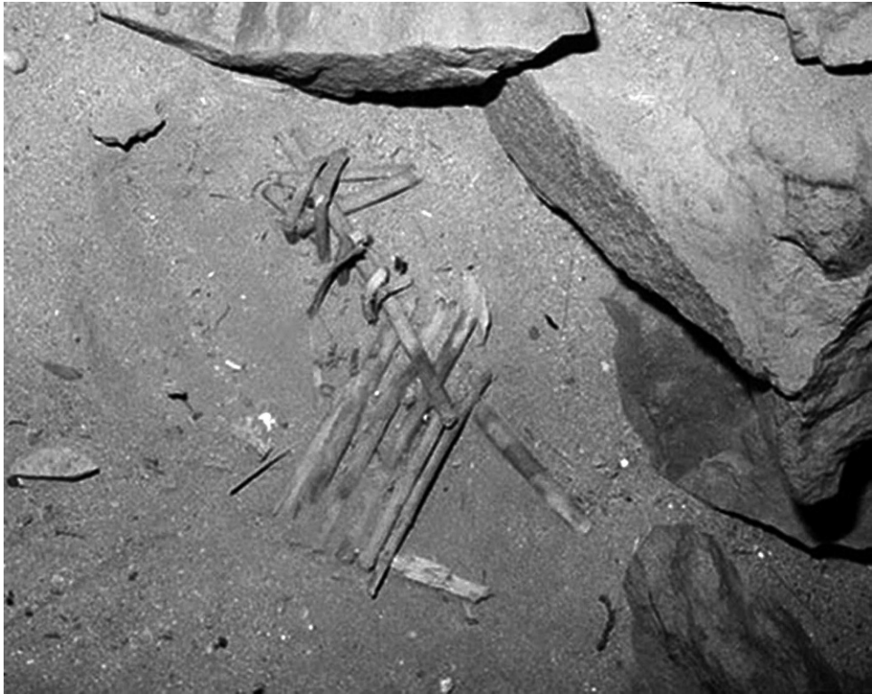
Figure 1. A typical split-twig figurine as found in situ at Shrine Cave, Grand Canyon.

time period between 4100–3500 BP. The exact role of these objects in Archaic culture will never be known, but the most logical explanation is that they were used in a hunting ritual as a form of offering to enhance the hunter's success. This interpretation is based on the discovery of at least six figurines with a small spear in their sides, and six others with an artiodactyl's dung pellet purposely placed inside. Furthermore, all figurine sites in Grand Canyon were only used for this ritual by the Archaic hunters; no evidence for habitation has been found at any of these sites. Figurines that have been found at sites outside Grand Canyon are often constructed differently from the Grand Canyon artifacts, do not date to the same period and are usually much younger in age, and likely did not have a similar function (Coulam and Schroedl 2004).