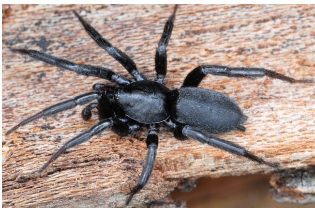
Fig. 2: Zelotes acarnanicus sp. n. Habitus of holotype

uted as in Fig. 3c. Sternum ovoid, truncated anteriorly, very slightly projecting between coxae IV. Maxillae constricted at middle. Labium ligulate, about twice as long as wide.