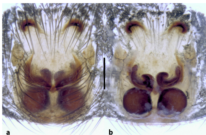
Fig. 6: Zelotes acarnanicus sp. n., photos. a. epigyne in ventral view. b. vulva in dorsal view. Scale bar 0.2 mm