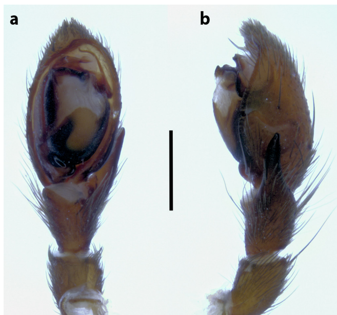
Fig. 4: Zelotes acarnanicus sp. n., male, photos. a. left palp in ventral view. b. left palp in retrolateral view. Scale bar 0.5 mm