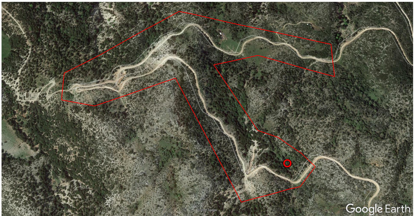
Fig. 1: Satellite image of Perganti Mt. covering the type locality of Zelotes acarnanicus sp. n. The area sampled for spiders is enclosed by the red line and covers approximately 25 hectares of rock-steppe and phrygana habitat situated 950–1060 m above sea level. Most specimens at this locality were sampled near the red circle (38.8314°N, 20.9750°E)