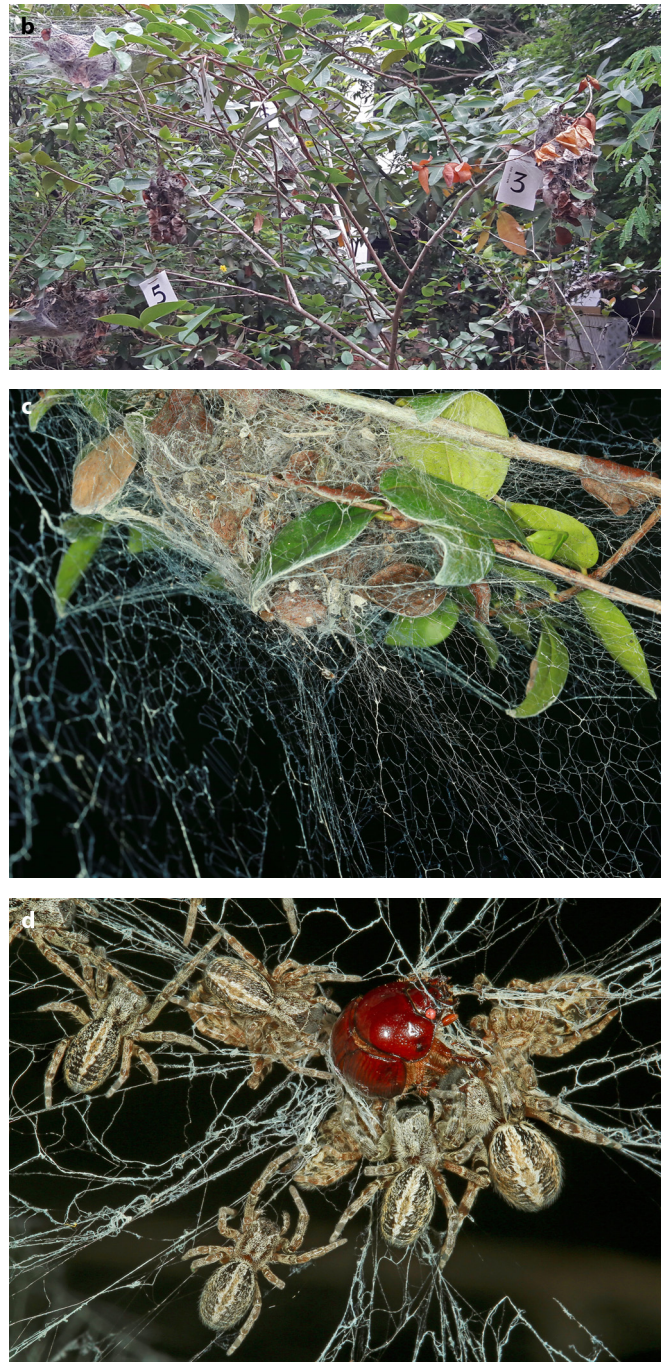
Fig. 1: a. Map of the study area at Christ College, Irinjalakuda (red spots = social spider web colonies); b. distribution of colony in Eugenia uniflora ; c. an individual colony of S. sarasinorum ; d. immobilization of the prey

Stegodyphus sarasinorum Karsch, 1892 (Eresidae), is a permanent social spider found in India, Sri Lanka, Nepal and Myanmar (Kraus & Kraus 1988, WSC 2019). It makes large complex silk nest of variable sizes on bushes, shrubs, rocky areas and open fields, where flying insects are abundant (Bradoo 1972). The nest is placed in trees and shrubs or sometimes fences, and made by incorporating the structure, leaves,