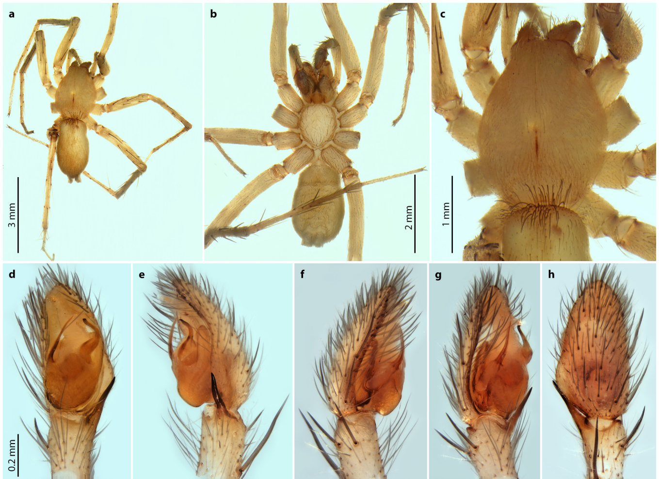
Fig. 2: Agraecina agadirensis , male. a. Dorsal view; b. Ventral view; c. Prosoma, dorsal view; d. Pedipalp, ventral view; e. Idem, retrolateral view; f. Idem, prolateral view; g. Idem, ventro-prolateral view; h. Idem, dorsal view

Material. 1 ♂, MOROCCO: region of Souss-Massa, prefecture of Agadir Ida-Outanane, caïdat of Taghazout, county of Aqsri, village of Tizgui, Ifri Ouado cave (Imi Ougoug) (30.61229°N, 9.46710°W, 770 m a.s.l.), on rocky soil with presence of pebbles (near a small stream), hand collecting, 22. Apr. 2021, leg. S. Moutaouakil (will be deposited at the Senckenberg Museum Frankfurt). Remark: left pedipalp and right leg II detached; left leg III missing.