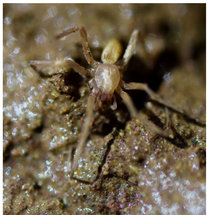
Fig. 1: Agraecina agadirensis , male (Morocco, Tizgui, Imi Ougoug, Ifri Ouado cave)

Agraecina agadirensis Lecigne et al. 2020: p.13, figs 1a, 4a-h, 5a-b (descr. female)