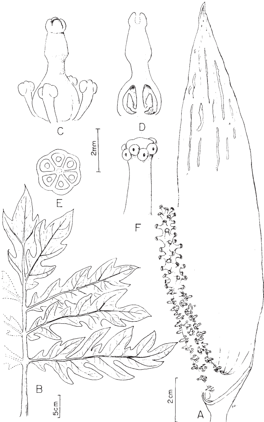
Fig. 3. Gorgonidium bulbostylum – A: spadix, spathe partially cut; B: leaf; C: female flower, side view; D: gynoeceum, longitudinal section; E: ovary, cross section; F: synandrium, side view. – Drawn from Liberman & al. 1857 by E. G. Gonçalves.