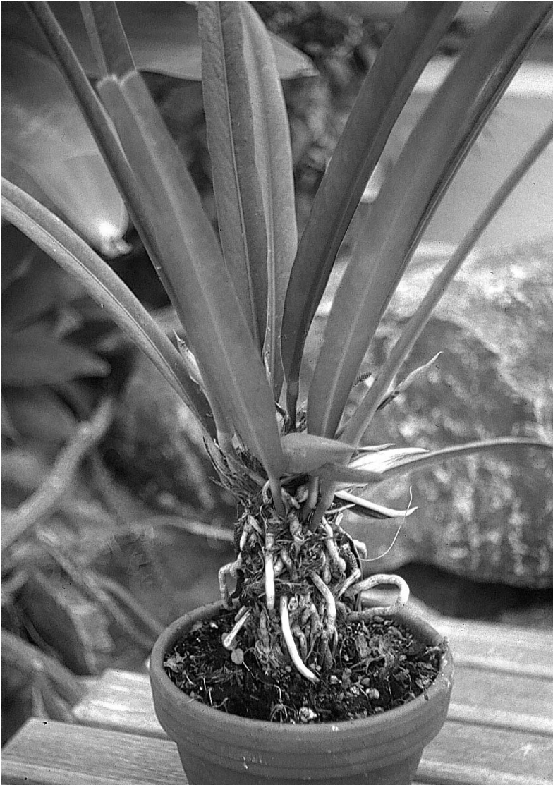
Fig. 1. Anthurium ensifolium – habit of a cultivated individual at the Munich Botanical Garden.

Stem thick, internodes short, 4.5-5.5 cm diam.; roots more or less dense, whitish to greenish, smooth; cataphylls lanceolate, 5-7 cm long, 0.6-0.8 cm wide, persisting as a mass of fibres. Leaves erect to slightly spreading; petiole 3.4-4.5 cm long, 0.3-0.5 cm diam., adaxially shallowly canaliculate with acute margins, abaxially rounded, the surface minutely white-punctate in fresh material, medium to dark glossy green; geniculum slightly thicker than the petiole, clear glossy green, 0.5-1 cm long; sheath 1.4-2 cm long; blade coriaceous, linear-elliptic to linear-oblong, acute to shortly acuminate at apex, obtuse to acute at base, 34-57 cm long, 2-4.5 cm wide, broadest at middle or slightly below, margins very weakly undulate in dry material; surface mat, medium to dark green, sometimes slightly glaucous or velvety, lower face mat, slightly paler, densely white-punctate in living plants; both faces drying mat, yellowish brown;