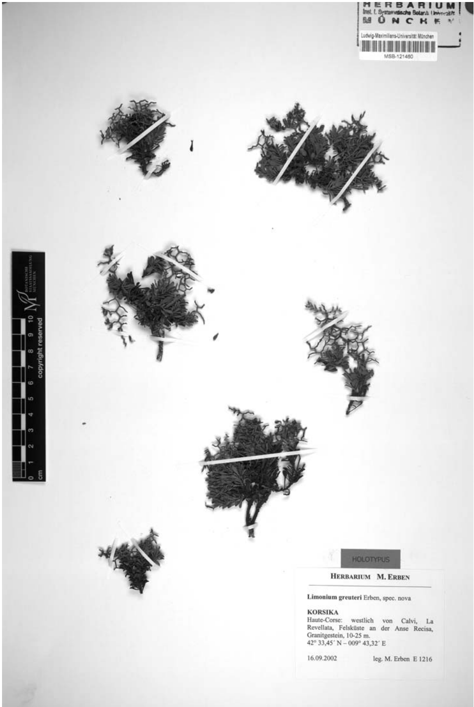
Fig. 1. Limonium greuteri , holotype.