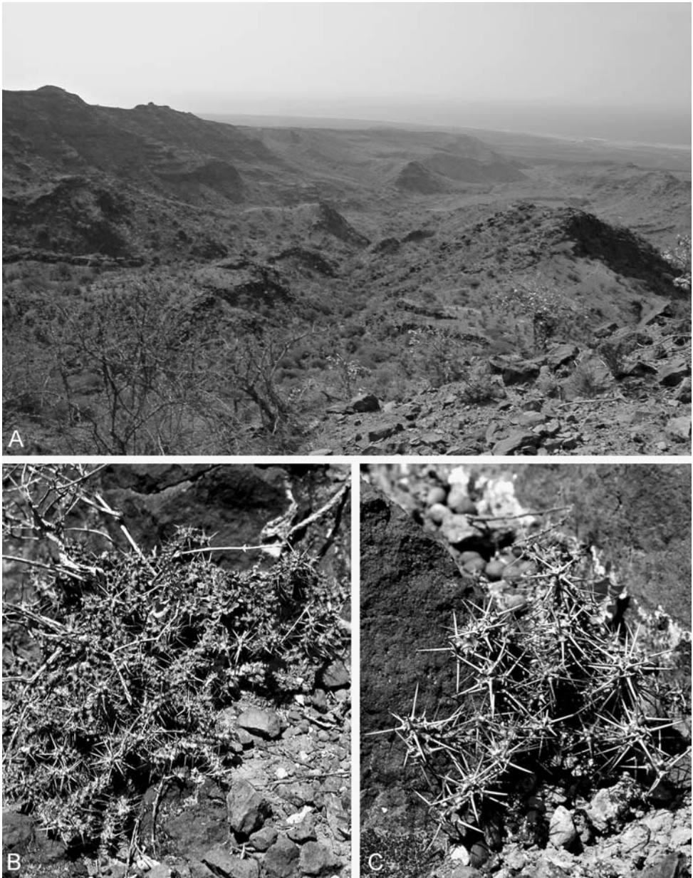
Fig. 1. A: Habitat of Euphorbia greuteri in the foothills of Jabal Urays facing the Gulf of Aden; B-C: E. greuteri , habit at type locality. – Photographs by P. Hein (B) and N. Kilian (A, C), March 2002.

up to c. 20 cm long and c. 1-1.5 cm wide (without spines), greyish green, with the spine shields situated on distinct tubercles in 5 spiral series (= in 7 longitudinal lines). Spine shields (podaria) brownish when young, becoming ash grey, subequilaterally rounded-triangular, transversal extent 2.3-2.6 mm, vertical extent 2.4-2.7 mm, the decurrent part (from the spine base to the lower edge) c. 1.2-1.4 mm; spines single, slender, 10-18 mm long, ash grey, distally often blackish; prickles