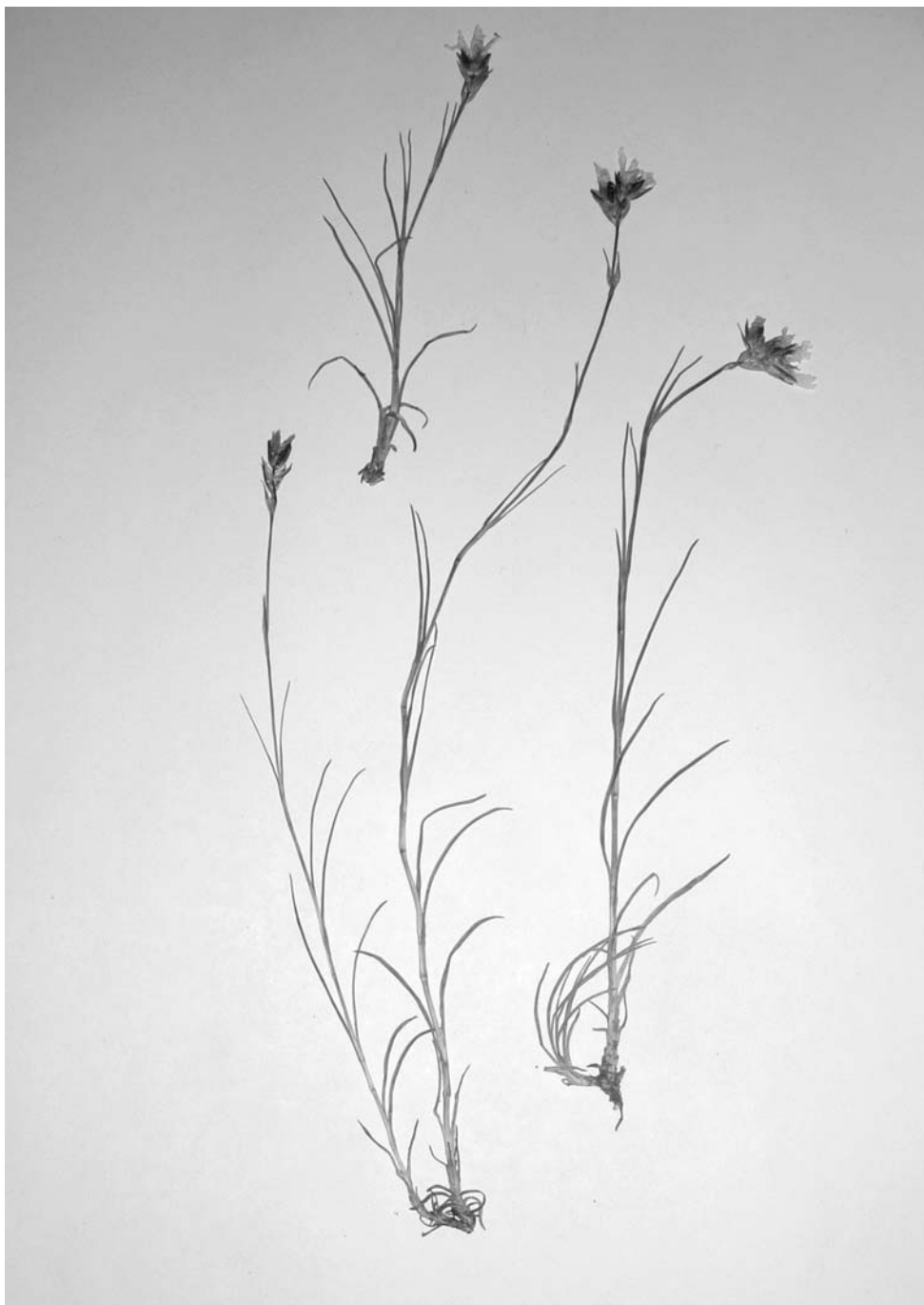
Fig. 2. Arenaria dianthoides subsp. tuncbasi – isotype at AYDN.