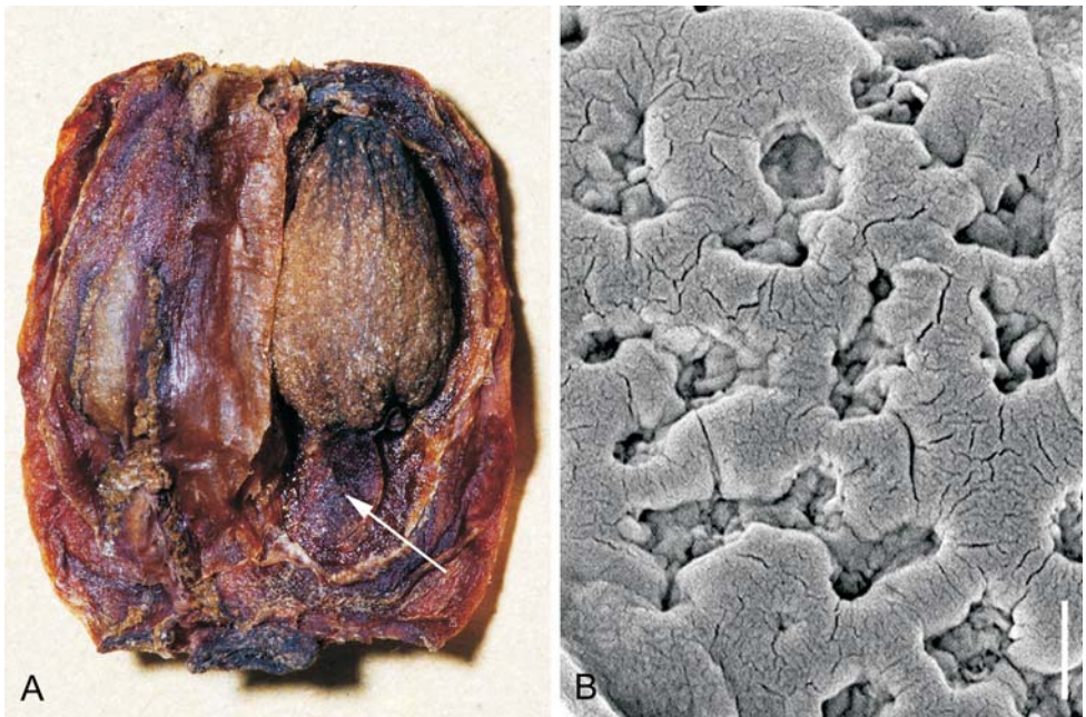
Fig. 3. Gorgonidium beckianum – A: berry, one locule opened to show the single ovoid, orthotropous seed with the funicle (arrow) still attached to the axile placenta; photograph from Kessler & al. 4823 (LPB); B: exine of pollen grain, fissures in reticulum artificial by preparation; SEM micrograph.