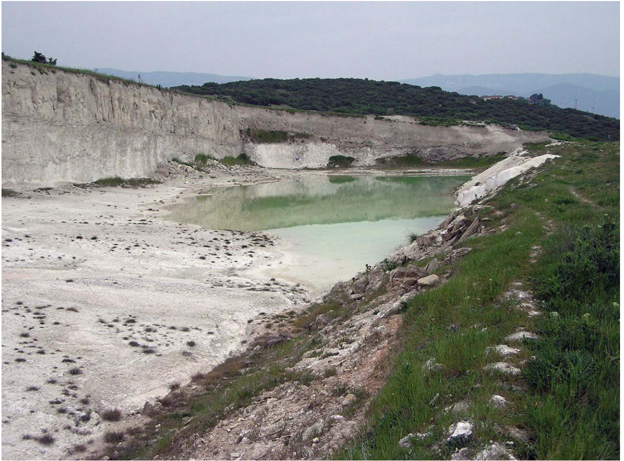
Fig. 3. Habitat of Puccinellia bilykiana in Greece.

– Gramen perenne dense caespitosum compactum. Culmi tenues geniculato-ascendentes 5–10 cm alti. Paniculae valde contractae, 8–12×3–5 mm metientes. Spiculae 3–3.5 mm longae, 3–4-florae; rhachilla scaberula; glumae late ovatae, c. 2 mm longae, subaequales; lemmata 2.5 mm longa, inferne appresse pilosa. Antherae c. 1 mm longae.