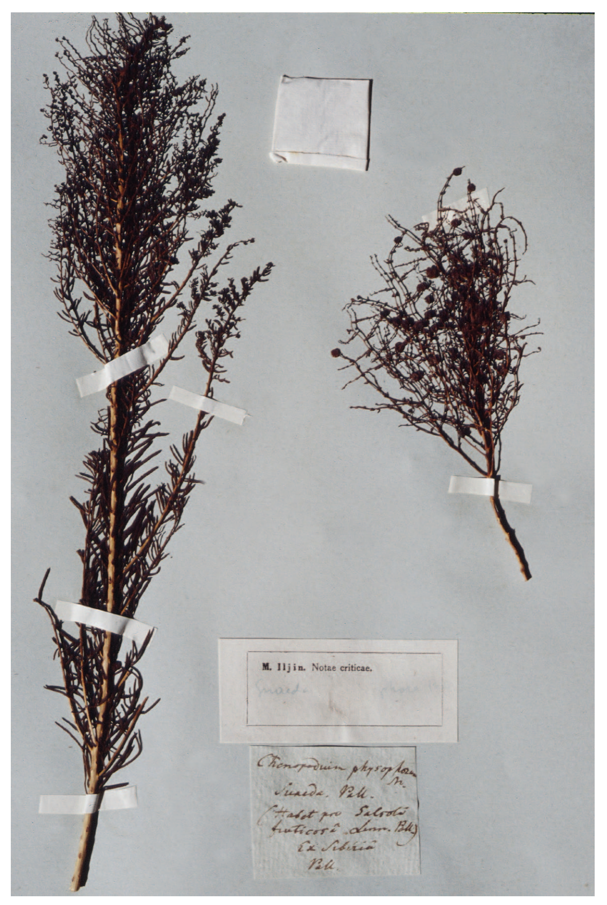
Fig. 3. Suaeda physophora Pall. – type sheet at St Petersburg (LE). The right-hand plant is selected as lectotype because it has a glabrous surfaces and well-developed fruits; the left-hand plant was collected at a different location, shows densely papillose surfaces and is the holotype of var. papillosa described in the Appendix.