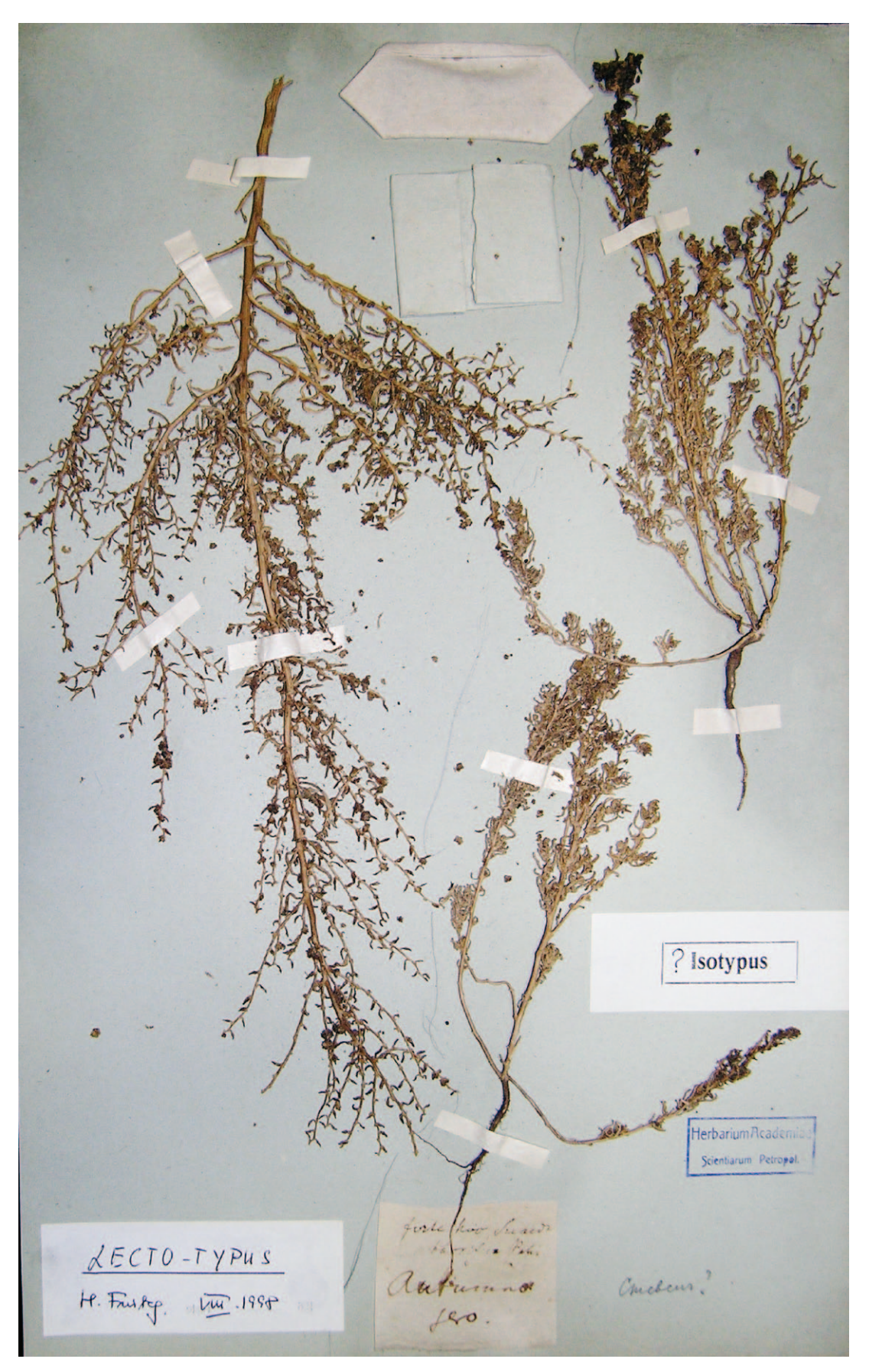
Fig. 1. Suaeda baccifera Pall. – type sheet at St Petersburg (LE). The two right-hand plants have been chosen as lectotype, while the left plant belongs to S. salsa (L.) Pall. – Photo by M. Lomonosova.