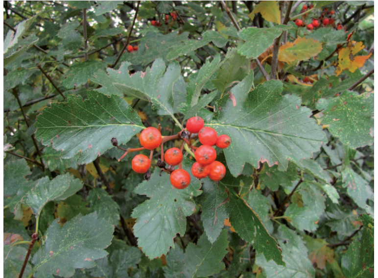
Fig. 5. Sorbus tauricola , fruiting branch showing the glossy upper side of the leaves. — Crimea, Ai-Petri Mt, 25 Sep 2010.

The Crimean whitebeams that belong to the apomictic complex of Sorbus latifolia (Lam.) Pers. s.l. were first discovered by Zelenetzky (1906), who identified them as “ S. scandica Fries”. Stankov (1927) reported the plant as S. latifolia . Popov (1959a) acknowledged the isolated occurrence of the Crimean plants and their difference from Central European whitebeams and described the Crimean populations as S. pseudolatifolia K. Popov. Popov provided an extensive description in Latin but designated two gatherings as types, one in flower and the other in fruit, making the new name not validly published under Art. 40.1. Zaikonnikova (1985) renamed the species because of homonymy but omitted the type designation, and this issue was also neglected in a recent list of Ukrainian type specimens (Fedoronchuk 2006). The name suggested by Zaikonnikova is in current use (Czerepanov 1995; Mosyakin & Fedoronchuk 1999; Zaikonnikova 2001; Yena 2012) and is validly published here. Under Art. 46.5 and 46.10 its authorship is “Zaik.