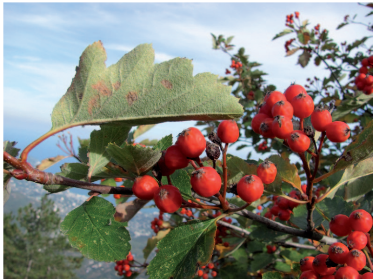
Fig. 6. Sorbus tauricola , fruiting branch showing the grey-green tomentose lower side of the leaves. — Crimea, Ai-Petri Mt, 25 Sep 2010.

ex Sennikov”; the name may not be attributed to Zaikonnikova alone under Art. 46.2.