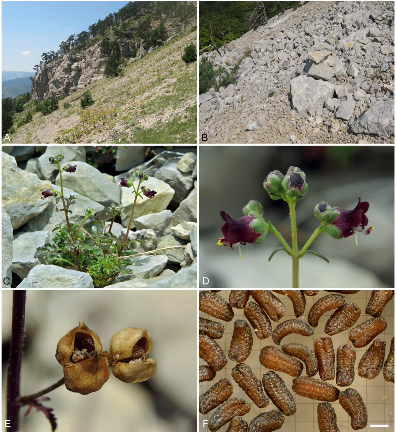
Fig. 1. Scrophularia exilis and its habitats – A: habitat at Djunyn-Kosh; B: habitat at Shagan-Kaya (mobile part of the scree); C: general aspect of a flowering plant; D: flowers and buds; E: capsules; F: seeds. – Scale bar = 1 mm.

In 2012, we were successful in rediscovering Scrophularia exilis in its type locality, as well as in a second locality, and in collecting new material for the first time since the collection of the type specimens in 1929. The purpose of this paper is to give the diagnostic characters of S. exilis according to our new data, to establish its differences from S. heterophylla subsp. laciniata , to ascertain coenotic conformity of the species and to provide an updated key to the species of Scrophularia in the Crimean flora.