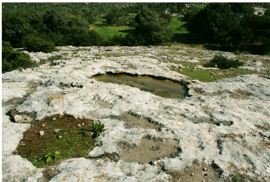
Fig. 3. Cupular pool complex supporting Callitriche pulchra . – Greece, Gavdos, Agios Pan-teleimonas, 20 Mar 2015, photograph by Richard V. Lansdown.