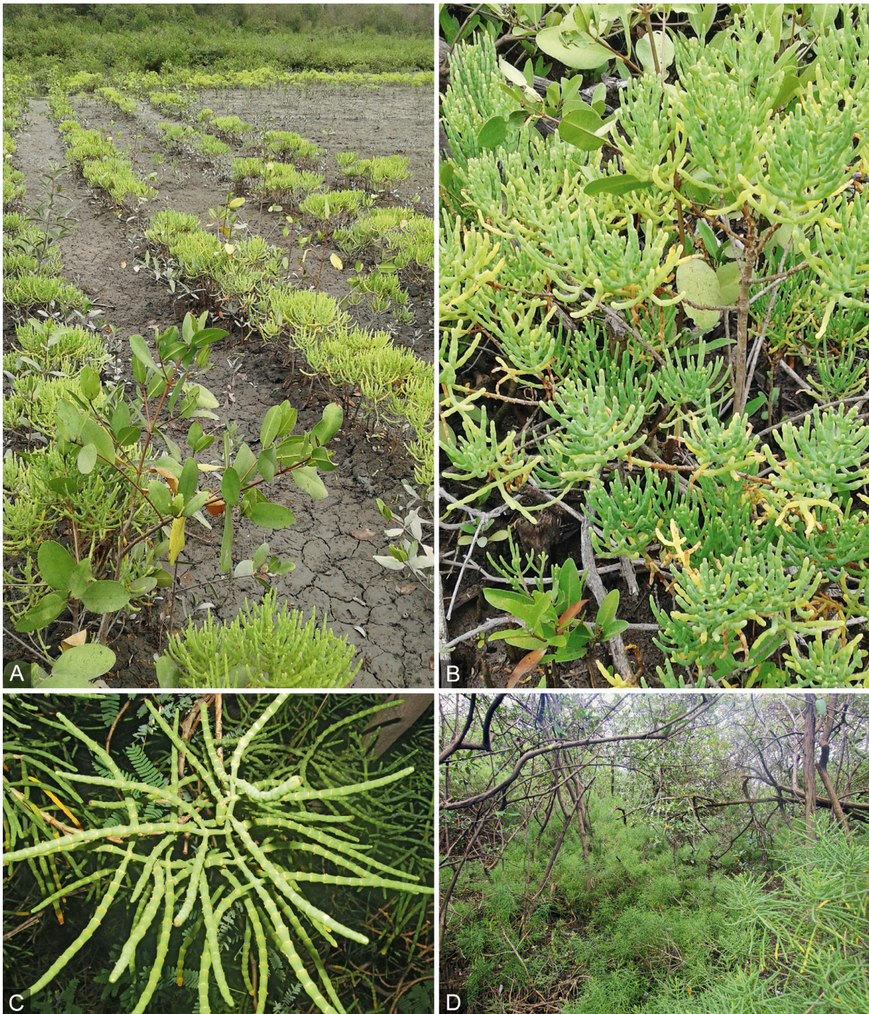
Fig. 1. Mangleticornia ecuadorensis in Reserva de Produccion Faunistica Manglares El Salado. – A: Open ground with many young plants of M. ecuadorensis in rows (Sep 2016). The occurrence in rows might result from the deposition of the floating disarticulated segments on tidal drift lines. – B: M. ecuadorensis grows as compact, mostly 0.8–2 m high, sprawling shrubs (Sep 2016). – C: The inflorescence consists of branched spikes that are up to 10 cm long and composed of 5–20 fertile segments (27 Jan 2017). – D: One typical habitat of M. ecuadorensis is the understory in an Avicennia germinans stand (27 Jan 2017).

which usually consist of a terminal, unbranched, spike-like thyrse, but shorter branches may arise from nodes beneath the base of the spike. In these instances, the side branches are at an acute angle (relevant to the main axis) and may curve upwards. In both the potentially new plant