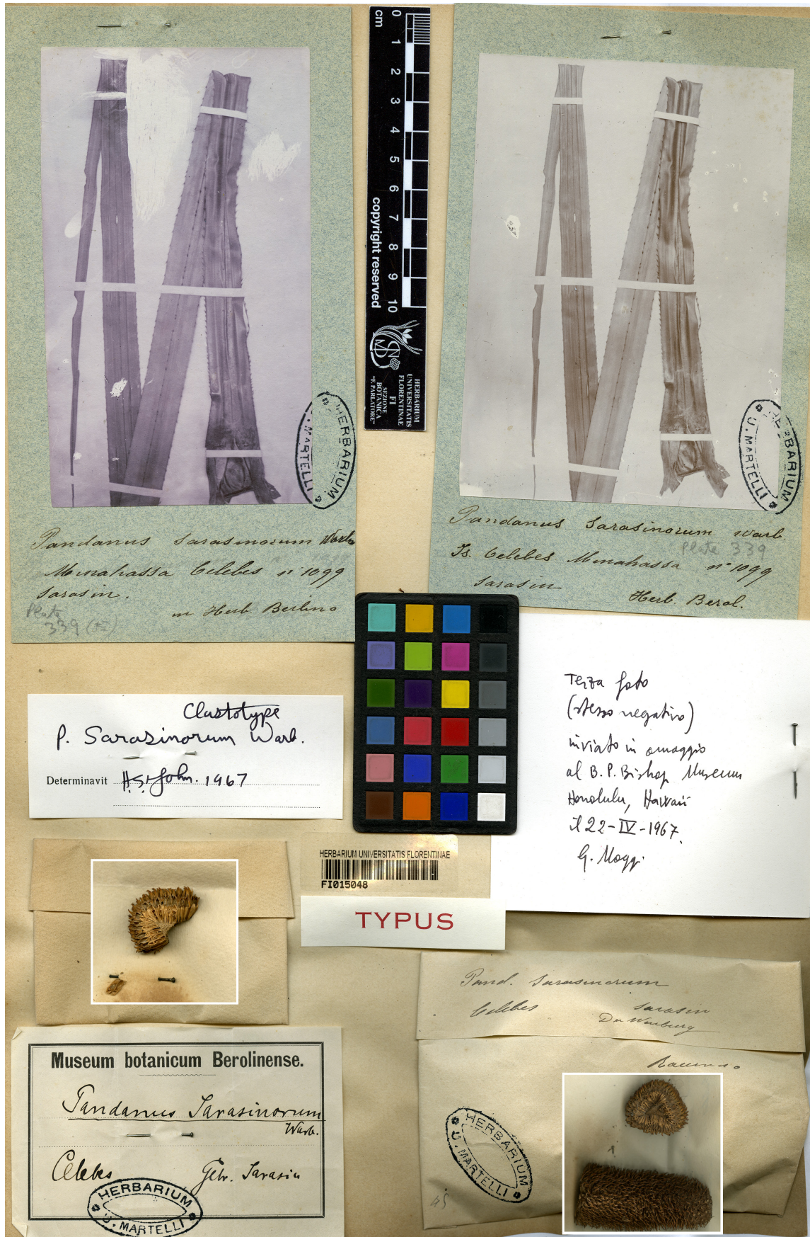
Fig. 6. Lectotype of Pandanus sarasinorum : Sarasin 1099 (FI015048).