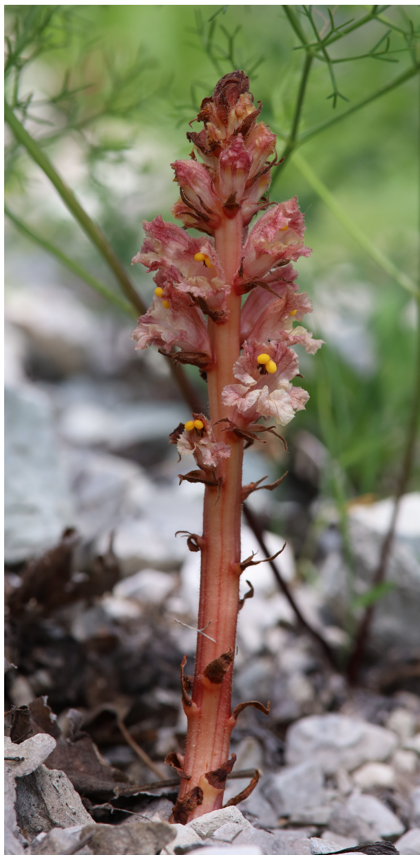
Fig. 6. Orobanche kurdica – Plant in flower, parasitizing Cachrys microcarpos. – Russia: Dagestan, Levashi district, vicinity of Tsudakhar, 20 Jun 2021