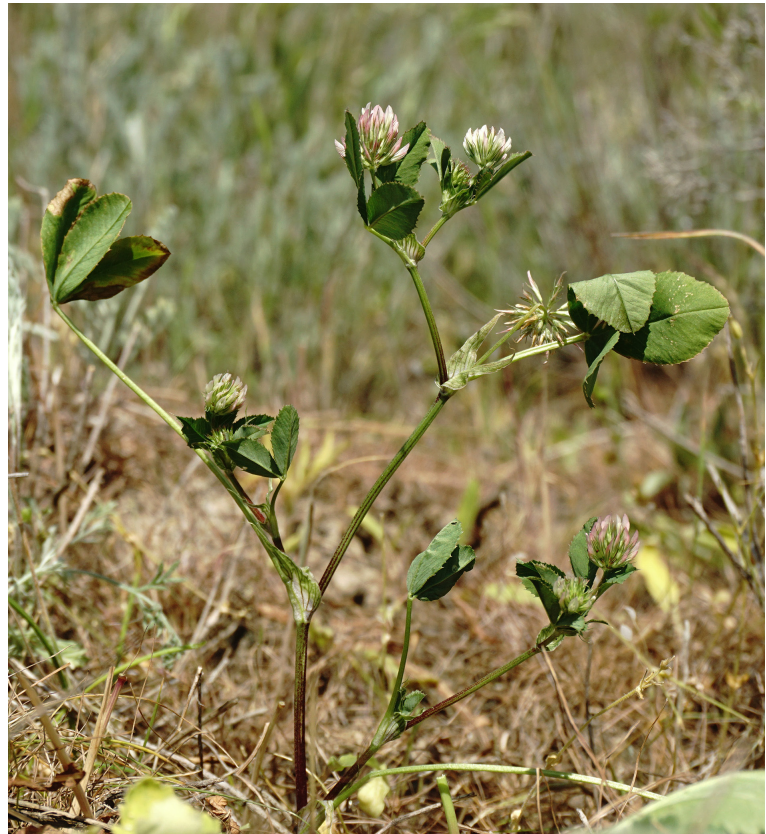
Fig. 4. Trifolium angulatum – Stem with inflorescences. – Crimea: Lenino district, Karalarty nature park, Sernaya river, 14 May 2021, photograph by S. A. Svirin.

A Gg(G): Georgia: Kakheti Region, Signaghi, 9 April Street in historical centre of town, 41°37'03"N, 45°55'27"E, c. 760 m, five plants, 21 Sep 2021, Novák (photo [Fig. S2, see Supplemental content online]). – Mirabilis jalapa is an ornamental plant of American origin that is commonly cultivated in gardens in Georgia. In