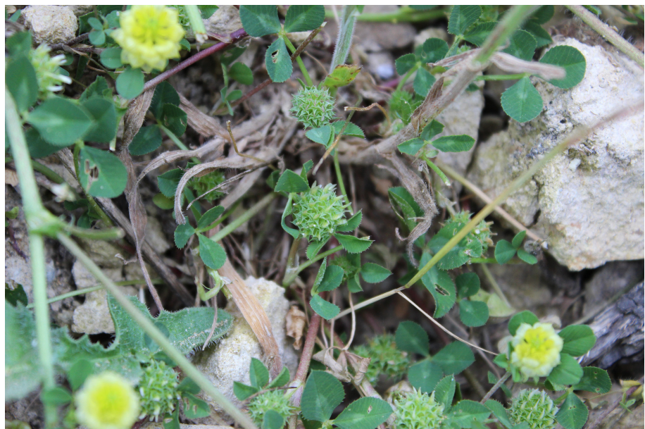
Fig. 5. Trifolium pachycalyx – Stem with inflorescences (green calyces and small, pinkish corollas); mixed with T. campestre Schreb. (conspicuous, yellow corollas). – Greece: North Aegean, Limnos (Lemnos) island, 1.5 km NW of Roussopouli, semi-wet wayside between fields, 26 Apr 2018, photograph by J. Krause.

the town of Signaghi, it was recorded as an occasionally escaping species. It was observed in the trampled vegetation (class Digitario sanguinalis-Eragrostietea minoris ), where it preferred less disturbed places, ac-