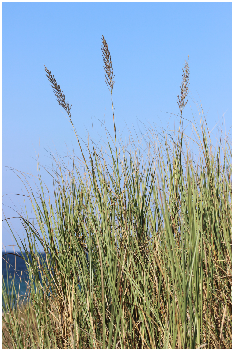
Fig. 3. Saccharum spontaneum – Greece: North Aegean, Limnos (Lemnos) island, Kotsinas, plant c. 2.2 m tall, 9 Oct 2016, photograph by J. Krause.

tanical Garden, E. virescens is a casual alien occurring in the same site as the previously discovered Oxalis latifolia Kunth (Ryff 2021). In 2021, its population occupied about 100 m 2 and included about 1000 individuals. Eragrostis virescens dominates with high abundance in Chenopodieta weed plant communities together with Amaranthus retroflexus L., Capsella bursa-pastoris (L.) Medik., Chenopodium album L. s.l., Digitaria sanguinalis (L.) Scop., Oxalis latifolia , and species of Setaria P. Beauv.