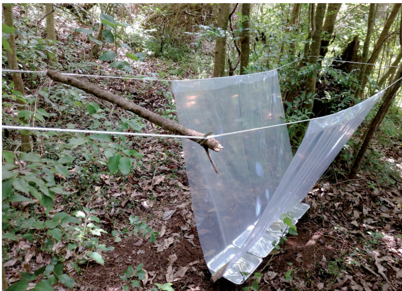
Fig. 2. Travel version of V-flight intercept trap.