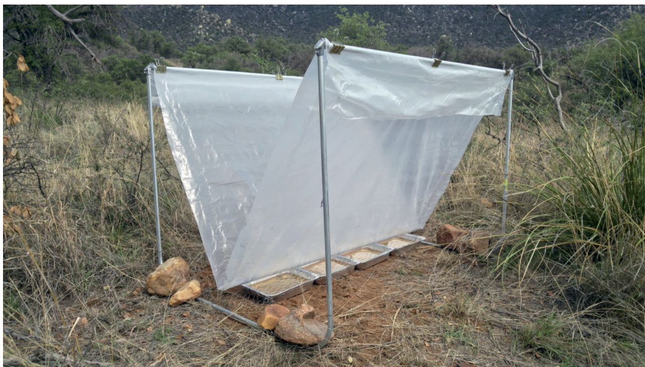
Fig. 1. V-flight intercept trap, with metal frame.