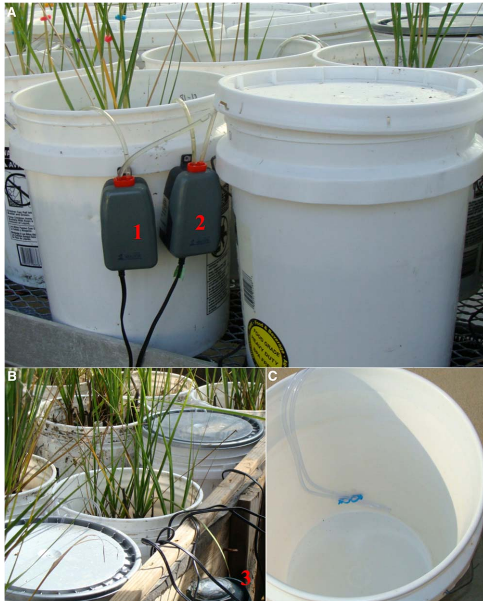
Fig. 1. Tidal simulator microcosm units consisted of one 18.9-L bucket containing a Spartina alterniflora sward connected to a second reservoir bucket (with a lid to prevent evaporation) by aquarium tubing attached to two water-lifting pumps. Pump 1 transferred water from the reservoir into the microcosm, and pump 2 transferred the water from the microcosm back into the reservoir (A). Units were connected to an outdoor timer (3) programmed to create tidal exchange every 6 h (B), and aquarium tubing extended from pumps to the bottom of both the microcosm and reservoir buckets to ensure complete transfer of water between them (C).

special facilities required by other systems (Table 1). Finally, growth of tidal marsh macrophytes in our simulators was tested against growth of plants exposed to natural tidal inundation in the field.